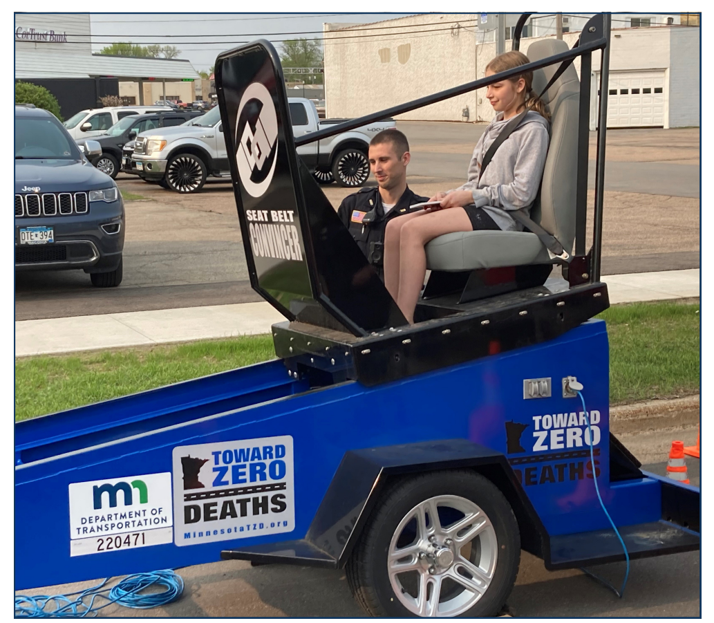
During an event in Glencoe this spring, members of the McLeod County Toward Zero Deaths Safe Roads Coalition invited participants to take a ride on the Seat Belt Convincer, which simulates the feeling of riding in a motor vehicle during a low-speed crash. The hope is to convince people to deligently wear seat belts.

Higher numbers of motor vehicle crashes during the past two years mark a reversal from previous years. During the past 10 years, the county has reported, on average, three fatalities per year. Lower traffic volumes