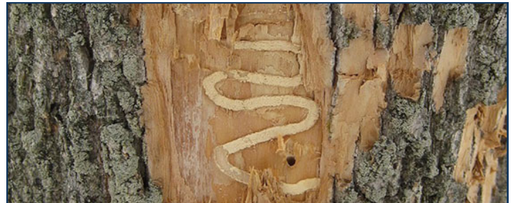
One way to identify EAB infestation in a tree is that the larvae leave tunnels and D-shaped holes beneath the bark.