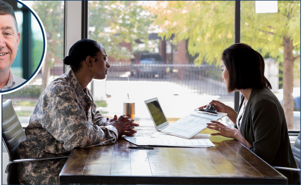
McLeod County Veterans Service Officers are ready to help veterans and their families answer important questions about the PACT Act and what it means for their benefit eligibility.