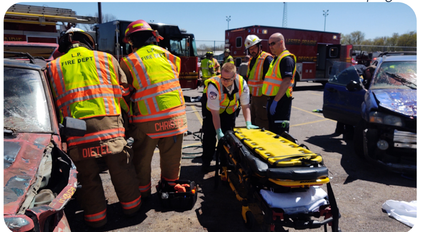
Pictured above: A scene from the 2021 Mock Crash event held in Lester Prairie, MN.