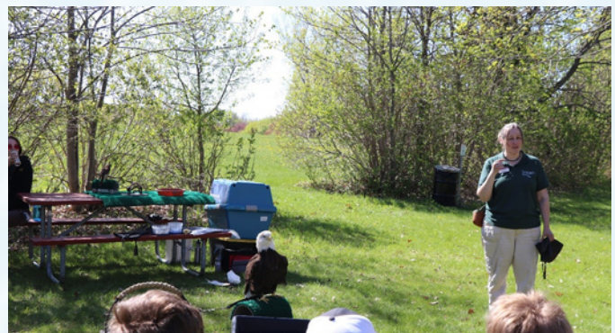
Area 4th grade students learn about the Bald Eagle courtesy of the University of Minnesota Raptor Center.

Hosted by SWCD, this event is in its 30th year and continues to be an exceptional partnership with McLeod County Parks and Public Works, the Minnesota Department of Natural Resources (DNR) and area volunteers.