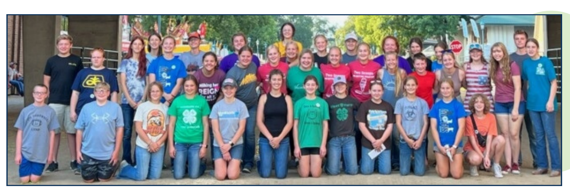
McLeod County 4-H had 43 youth livestock project exhibitors and 41 youth static project exhibitors at the State Fair this year, and they earned a combined 28 purple ribbons, 53 blue ribbons, and many more acknowledgments.