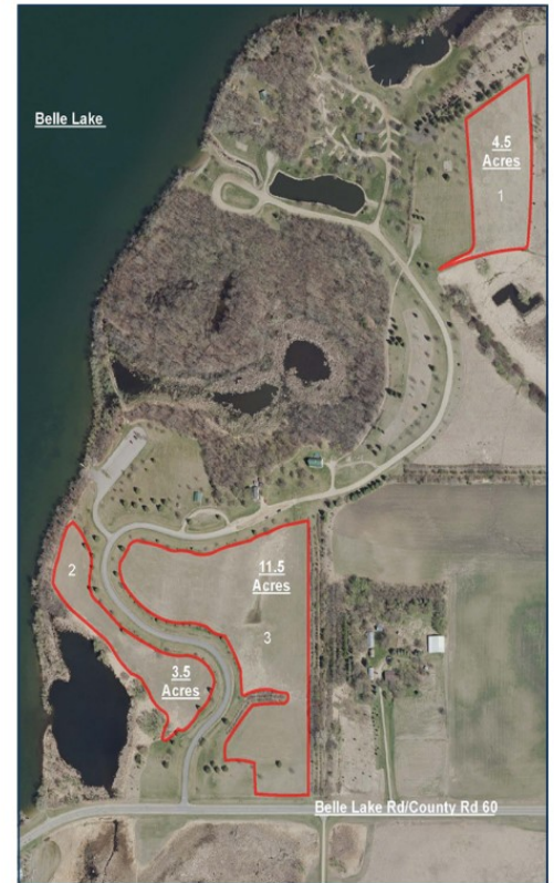
This map outlines the three areas of Piepenburg Park that will be enhanced by a seeding of native grasses and wildflowers this summer.

Three separate areas of Piepenburg Park will be seeded with a Minnesota CP42 Premium Pollinator Mix that consists of Big Bluestem, Sideoats Grama, Canada Wild Rye, Little Bluestem, Prairie Dropseed, and more than 30 species of native flowers and forbs. The areas to be seeded include a 4.5-acre section of short, cool-season grasses on the northeast side of the park; an 11.5-acre section of similar grasses east of the park entrance; and a 3.5-acre section of native grasses west of the park entrance that needs inter-seeding to enhance the existing vegetation.