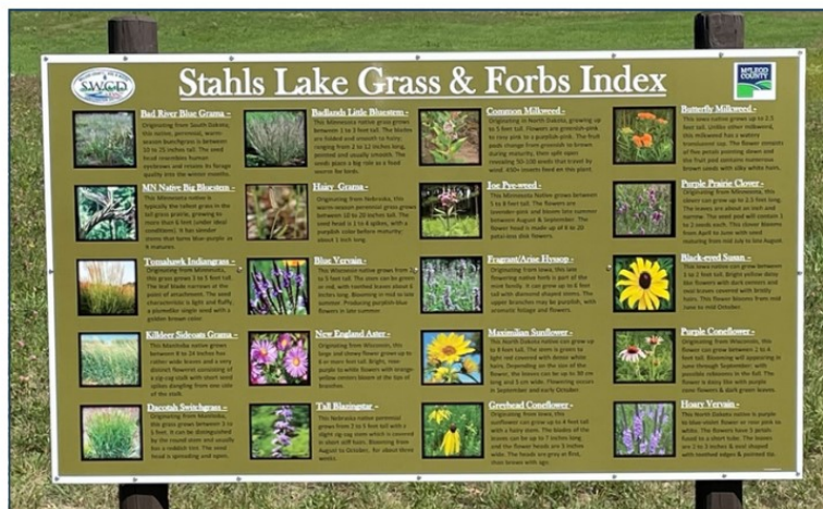
A similar prairie enhancement project was completed at Stahls Lake Park in 2019. This sign shows some of the different grass and forbs that will also be part of the restoration done at Piepenburg Park this summer.

The restoration will be completed in three phases ending in mid-July, and then park visitors will have to wait a year for the seeded areas to fully develop. In the meantime, park and wildflower lovers can travel a few miles south of Piepenburg Park to a 27-acre patch on the west side of Stahls Lake Park, where a similar restoration of native grasses was completed in 2019.