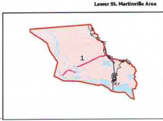
Lower St. Martinville Area