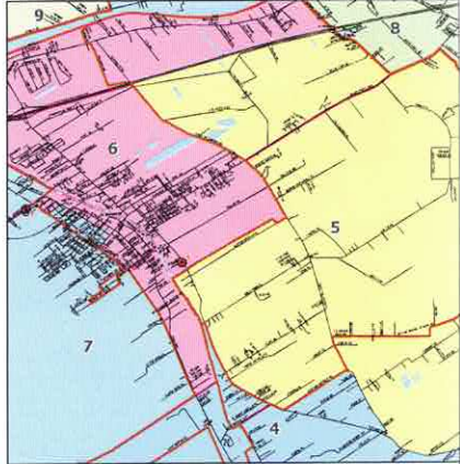
Breux Bridge Area