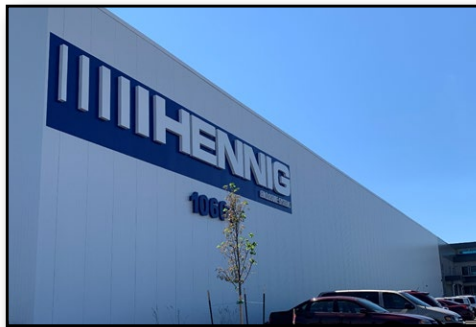
Northwest corner of the 125,000 sq. ft. addition to Hennig Inc., Enclosure Systems building at 10601 N. 2nd St.