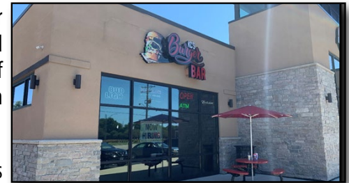
KC's Burger Bar will occupy the former Happy Wok at 6901 N. 2nd St.

KC's Burger Bar will be opening soon and will take over the Happy Wok at 6901 N. 2nd St. KC's will offer a burger commensurate with the kind you would find in a fine dining establishment but in a fast food atmosphere. The burger bar will have 8 specialty burgers, in half-pound or quarter-pound options – all of which will be ground fresh every day. Customers can choose from any of the specialty burgers or they can 'build their own' with a variety of toppings. KC's will also offer some top-quality breakfast sandwiches as well.