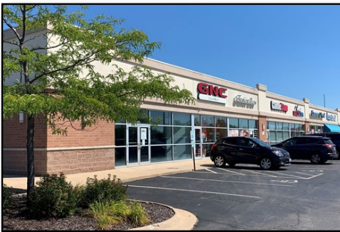
Shopko Optical Center will be located in the west end of 1550 West Lane Rd. This 2,600 sq. ft. occupancy addresses the last retail vacancy within the building.

Retail, industrial and hospitality segments all seeing growth in 2020