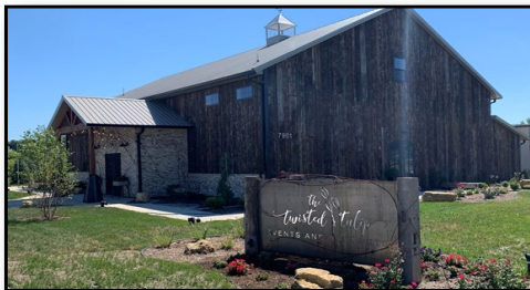
Twisted Tulip Events & Banquets Center at 7901 Burden Road.

The Twisted Tulip Events and Banquets center at 7901 Burden Rd. obtained their certificate of occupancy in July and has recently opened their doors for business. The 4,500 sq.ft. boutique banquet facility provides a contemporary and intimate setting for weddings, corporate events and other social gatherings.