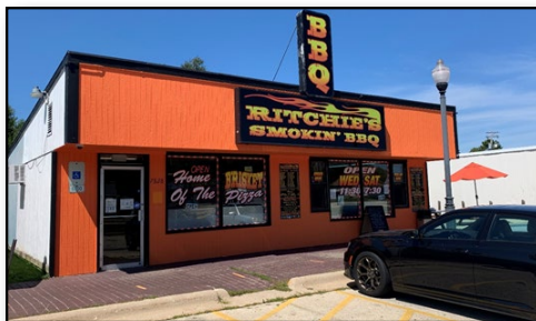
Ritchie's Smokin' BBQ at 7828 N. 2nd St.

The owner of Ritchie's Smokin' BBQ started two years ago selling BBQ sandwiches and cornbread from under a tent on Route 173 and N. 2nd. The newest location at 7828 N. 2nd Street in Machesney Park's downtown area has been busy with hungry customers since opening late spring.