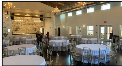
Inside of the Twisted Tulip Events & Banquet Facility.