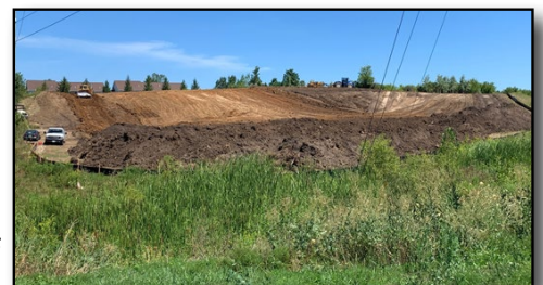
Excavators working on First Midwest Group's self-storage facility.

First Midwest Group broke ground on their newest self-storage facility on 5.6 acres at the northeast corner of Route 173 and Mitchell Rd., 7171 Mitchell Rd. in August.