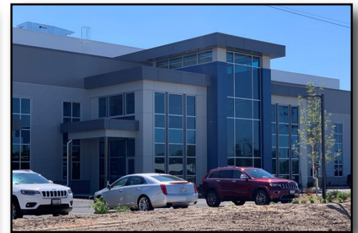
Front entrance at Hennig Inc., Enclosure Systems.

The Village is also enjoying development success beyond the retail sector. Hennig Inc. and Spider Company put the finishing touches on 255,000 sq. ft. of industrial space this summer and both projects were made possible as a result of Village support through tax increment financing and enterprise zone incentives. Hennig, Inc.'s $20 million, 125,000 sq. ft. addition will support the company's back-up generation enclosure division and create 60 jobs when complete.