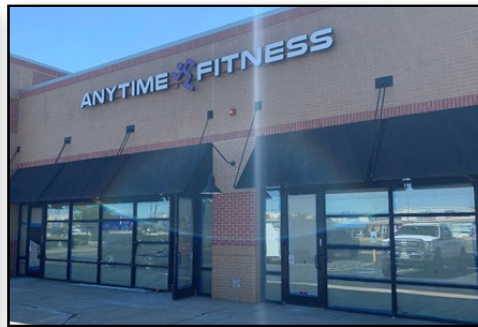
1531 West Lane, new location for Anytime Fitness Machesney Park.