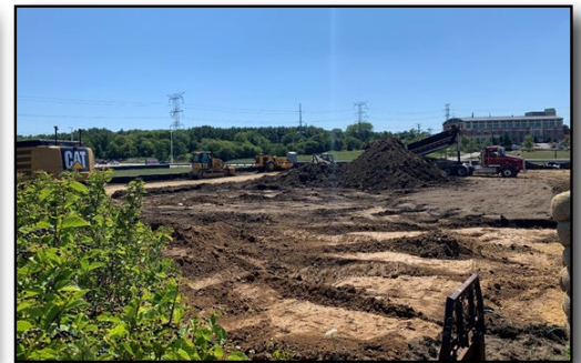
Contractors broke ground on Jiffy Lube's new 4,504 sq. ft. auto care center at 1766 West Lane Rd on 8/17/2020.

Construction is underway on a new Shopko Optical Center at the Gateway Shopping Center on Route 173, as well as immediately across the street on an Anytime Fitness at 1531 West Lane Rd. The Shopko Optical replaces a Radio Shack which brings the building at 1550 West Lane Rd. to full occupancy. Retail occupancy rates for buildings within the Route 173 corridor are approximately 99%. Jiffy Lube is building a new freestanding auto care facility in front of Meijer, along Route 173.