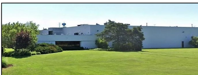
CQ+ Manufacturing Group at 8155 Burden Rd.

The Village is also enjoying development success beyond the retail sector. Hennig Inc. and Spider Company put the finishing touches on 255,000 sq. ft. of industrial space this summer and both projects were made possible as a result of Village support through tax increment financing and enterprise zone incentives. Hennig, Inc.'s $20 million, 125,000 sq. ft. addition will support the company's back-up generation enclosure division and create 60 jobs when complete.