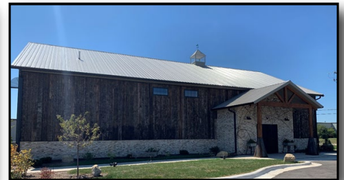
North elevation of the Twisted Tulip Events & Banquet Facility.

KC's Burger Bar will be opening soon and will take over the Happy Wok at 6901 N. 2nd St. KC's will offer a burger commensurate with the kind you would find in a fine dining establishment but in a fast food atmosphere. The burger bar will have 8 specialty burgers, in half-pound or quarter-pound options – all of which will be ground fresh every day. Customers can choose from any of the specialty burgers or they can 'build their own' with a variety of toppings. KC's will also offer some top-quality breakfast sandwiches as well.