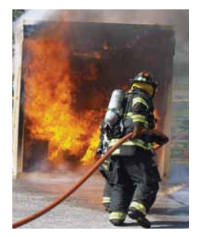
In a demonstration, firefighters extinguish a simulated room and contents fire at the Fire Prevention Week open house.

ynwood residents had the opportunity to visit the Fire Department, see emergency and rescue equipment close up, and watch firefighters in action during staged events at an October Fire