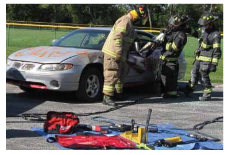
Firefighters open a car door using hydraulic rescue equipment.

Also participating in the event were Bud's Ambulance Service: Nicor Gas, which provided visitors with gas safety information; First