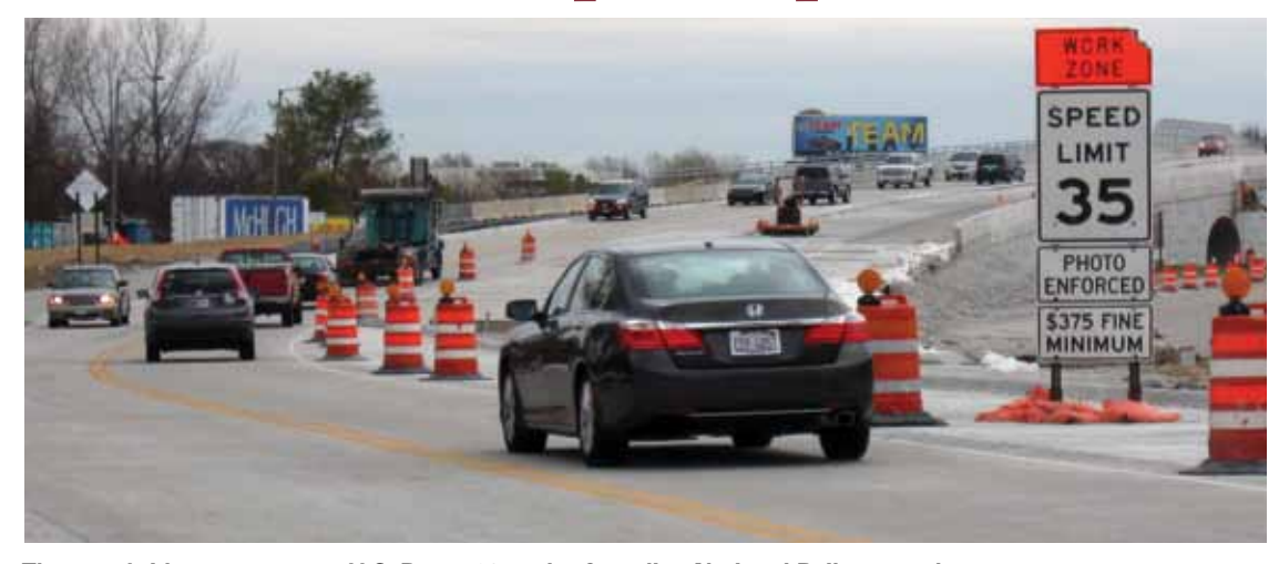
The new bridge overpass on U.S. Route 30 at the Canadian National Railway tracks.

The overpass bridge eliminates motorist delays at the railroad crossing, improving traffic flow and safety. The average daily traffic volume on Route 30 (Lincoln Highway) at the railroad location is