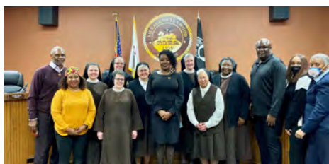
The Village of Lynwood Welcomes the Franciscan Alliance(Sisters of St. Francis)

The Fire Department is HIRING . Pick up an application at the Fire Station or in Village Hall.