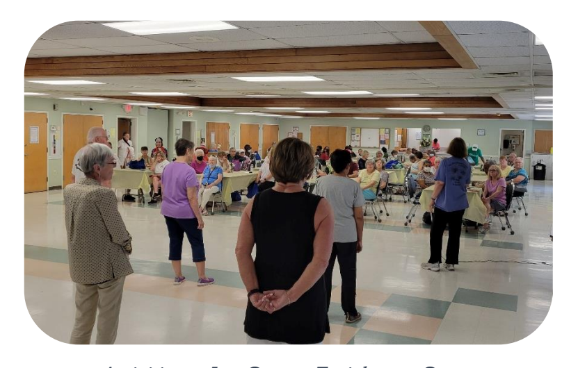
Activities at Lee County Enrichment Center

Our Senior Services and Veteran Services departments have been working to meet the needs of these populations in Lee County. The reopening of the Lee County Enrichment Center has met the demands of over 3000 of Lee County's older adults. Throughout the pandemic, services and programs were maintained, while new offerings such as virtual programming and meal deliveries were expanded.