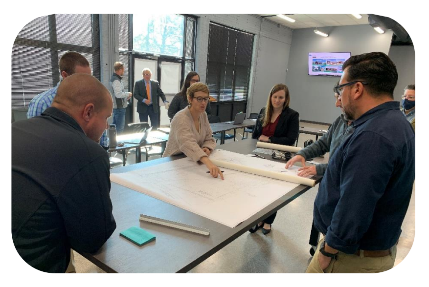
Design session for New Multi Sports Plex

Horton Park, and O.T. Sloan Park have all seen major renovations to include new playground equipment, shelters, basketball, tennis, and pickleball courts. Ramps and crosswalks have also been completed at many County buildings and parks, creating an accessible space for all. In addition to the physical additions, we have expanded our program offerings and seen massive jumps in registrations this year alone. When compared to pre-pandemic, we have seen over 600 more participants so far in 2022.