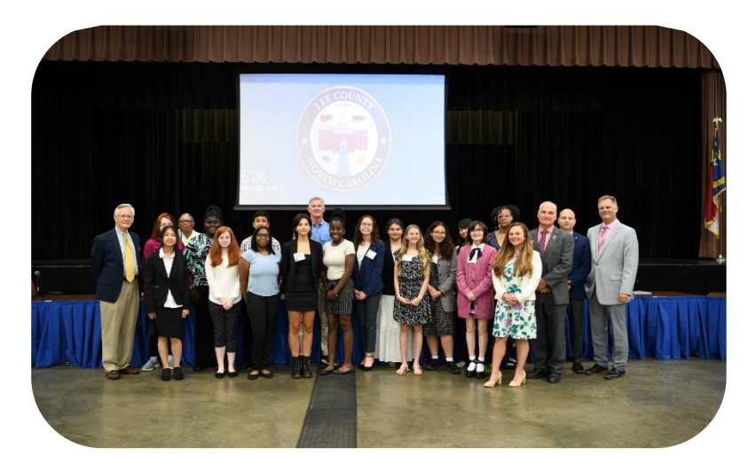
Recognition of 2022 Lee County Young Commissioners

Lee County Website for all official public County meetings, as well as opportunities to take an active part in the governance of Lee County through a number of citizen boards and commissions.