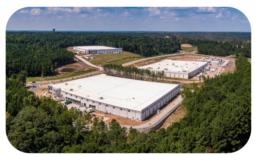
Shell Buildings at Central Carolina Enterprise Park

We are seeing thousands of new jobs being announced in our region every year. Four of the top 25 NC Job creating projects of 2021 are right here in Lee County, with Central Carolina Enterprise Park, alone, securing nearly $350 million in new capital investments. Large corporations such as Moen, Pfizer, Coty, Tyson, Caterpillar, Bharat Forge, and Astellas have opened and/or expanded operations in Lee County in just the past few years. This economic growth in Lee County has