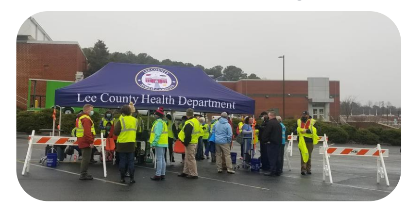
Covid-19 Vaccine Site in January 2021

Regarding the COVID-19 pandemic, we are now seeing cases rise and fall as new variants emerge. Please be aware of your own health and avoid spreading the virus if you find yourself with any associated symptoms. We continue to offer vaccinations, both Pfizer and Moderna, for Lee County residents and are now administering the bivalent booster vaccine to all who are interested in receiving it.