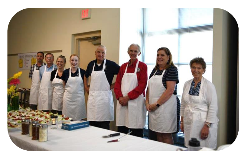
Lee County Employee Appreciation Lunch

To run our programs, Lee County now employs over 400 full time employees and upwards of 2-300 part time employees. Our job training ensures that each employee is provided what they need to succeed in their positions, and we pride ourselves on being a great place to work in our region.