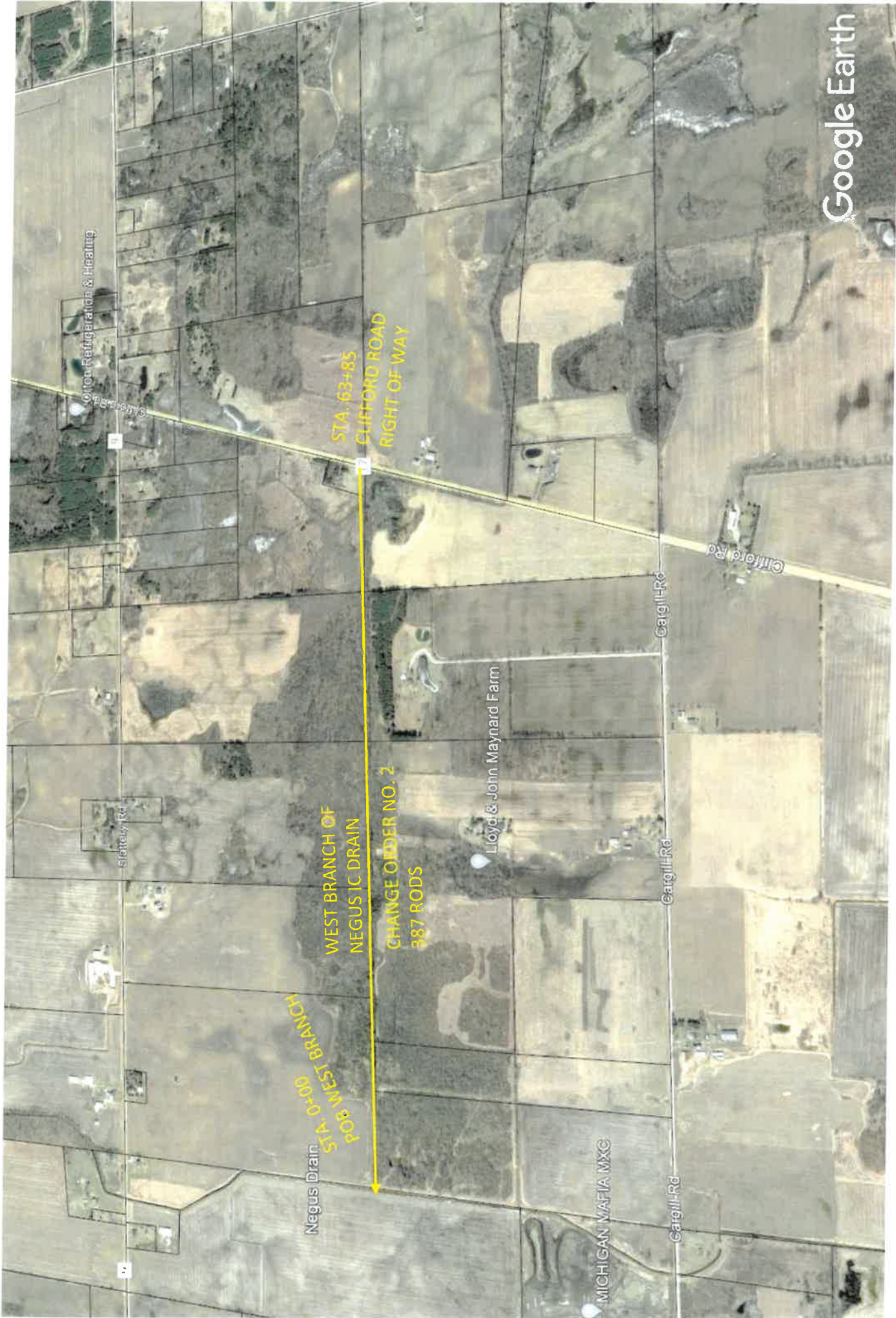
PROPOSED 2022_3 NEGUS IC DRAIN SCOPE – CHANGE ORDER NO. 2