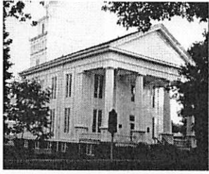
MICHIGAN'S OLDEST COURTHOUSE