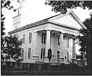
MICHIGAN'S OLDEST COURTHOUSE