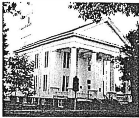
MICHIGAN'S OLDEST COURTHOUSE