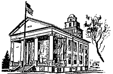
MICHIGAN'S OLDEST COURTHOUSE