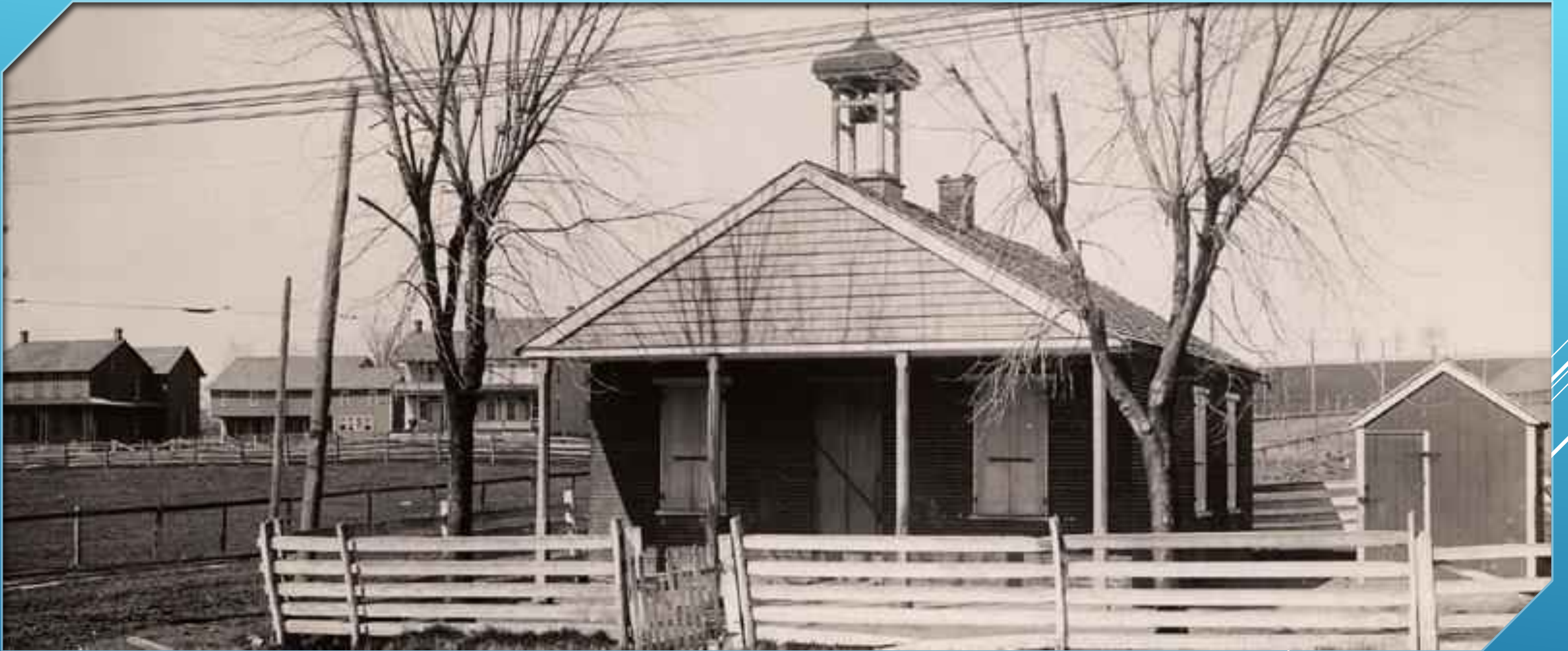
Also looking northwest, away from Columbia Avenue.