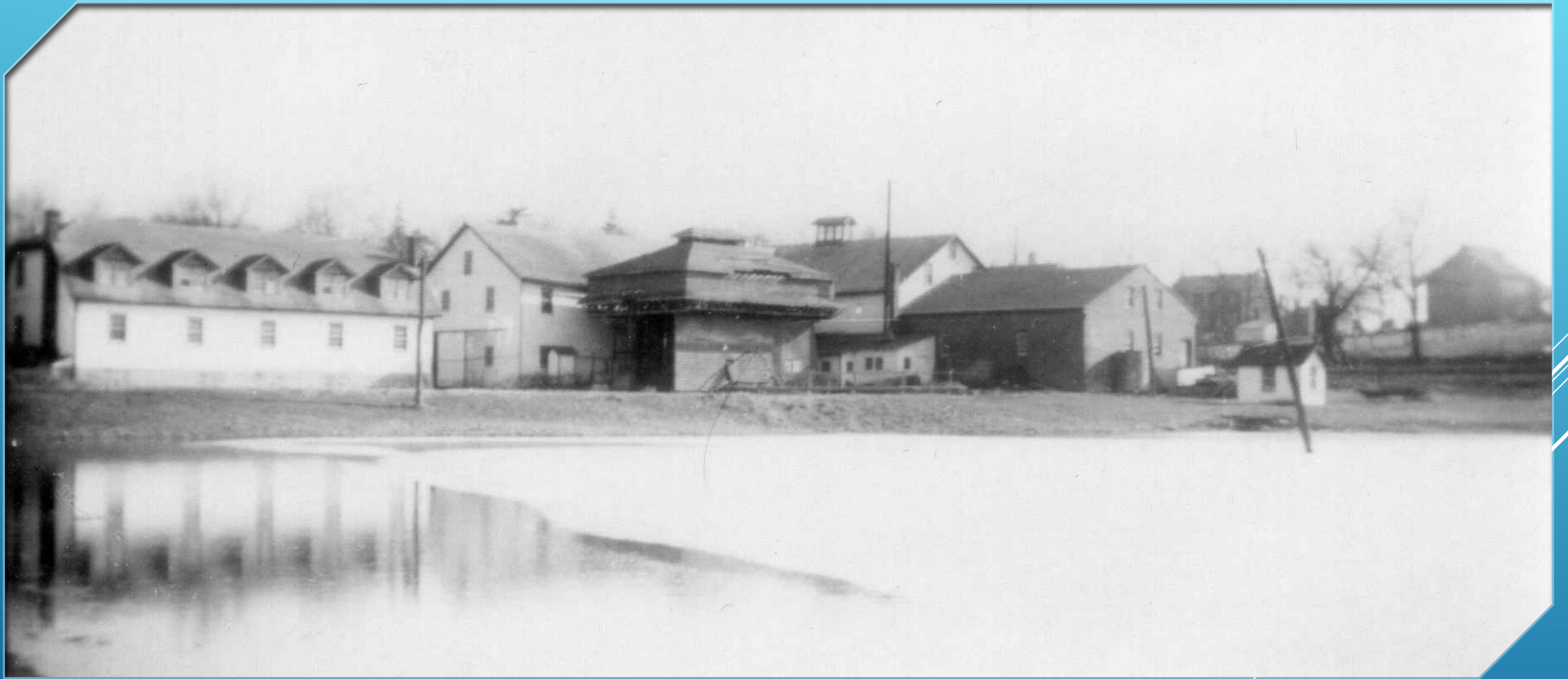
Looking southeast, towards Columbia Avenue.