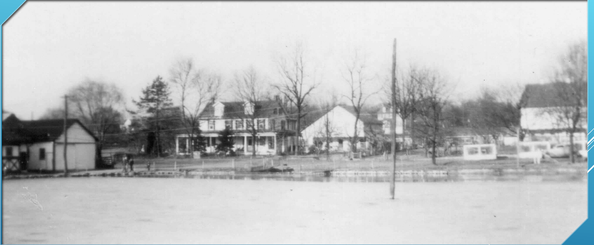
Looking northwest, away from Columbia Avenue.