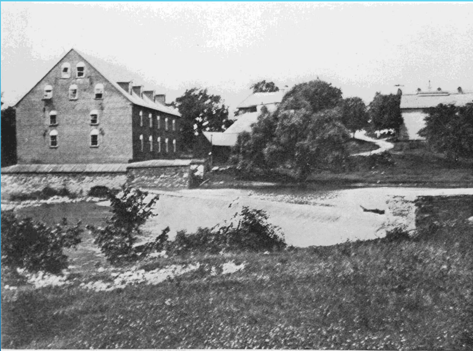
Ranck's Mill and Dam, Conestoga River.

LOOKING BACK ACROSS THE RIVER, THE ROAD WE KNOW TODAY WAS VISIBLE.