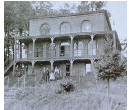
Hotel along Wabank Road, circa 1908

Long before it was the neighborhood where many families reside today, Gable's Woods was a park initially developed for the trolley company that ran along Millersville Pike from 1875 to the mid-1930s. Intended to increase ridership on the trolley, a large pavilion and other structures were built to accommodate large picnic groups.