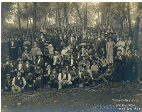
"Turner's May Walk" May 22, 1910.

Gable's Woods Park also afforded access to the Conestoga for boating, swimming, fishing, and waterside strolls.