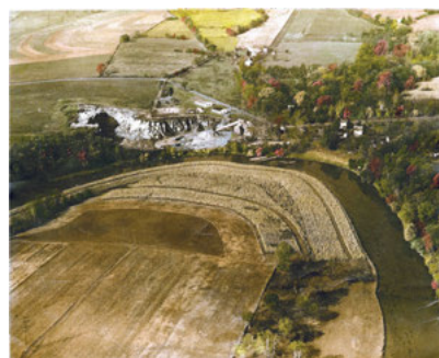
Date of photo is likely 1940-1958.

In the late 1980s and 1990s, the landscape was changed dramatically as hundreds of homes were built in a dramatic "cluster housing" development. The original farmhouse was preserved for use as an information center and sales office until it was also sold as a dwelling.