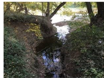
Where a swale discharges into a waterway

We count on citizens like you to help us identify problems in the watershed that drains to these locations. Here's a partial list of Illicit Discharges that we are asking you to report, if you observe them happening or see evidence of such an occurrence.