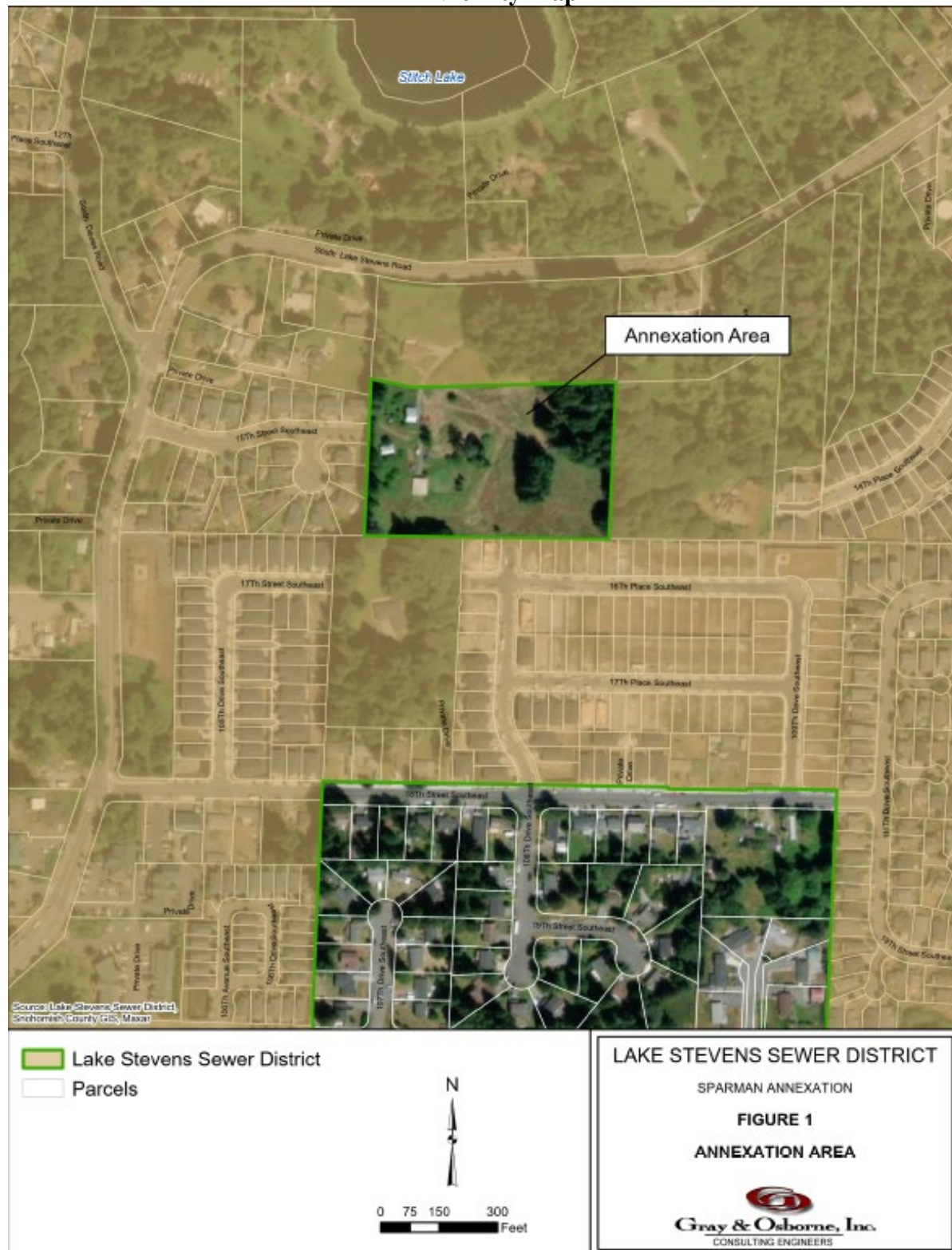
Exhibit B Vicinity Map