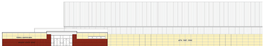
PROPOSED SOUTH ELEVATION SCALE: 3/32" = 1'-0"

The South Elevation of the new Wendell A Barwood Arena (WABA) provides a new and spacious entry into the arena with direct access to bathroom facilities, locker rooms, rink office and a concession stand that provides service windows to the lobby and rink.