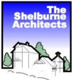
NEW JPM Logo 091208 Export.JPG 13K