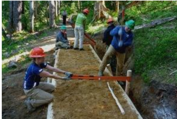
An example of a trail turnpike