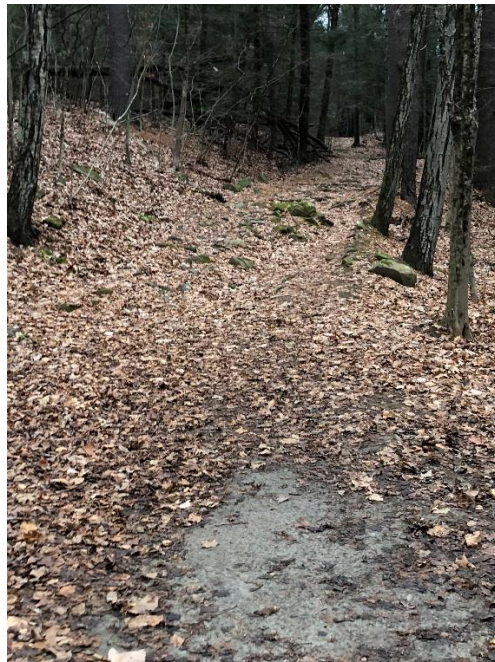
Trail from parking lot a short way up from previous photo.