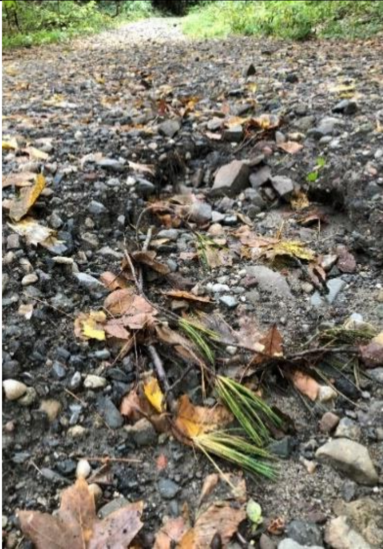
Close-up of erosion on the red trail (2021)