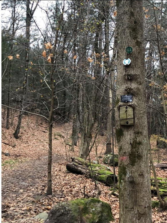
Trail from parking lot (on left). Signage denotes trail as green G1