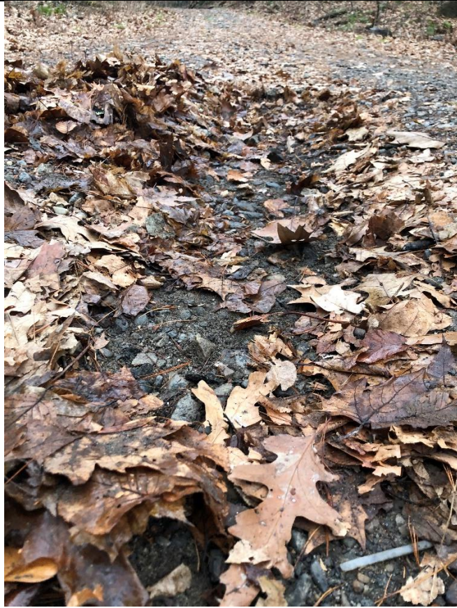
Same location on red trail as previous photo (2022)

The work will begin at the junction with the new, improved double blue trail then, down the red trail to and along a short section of the undesignated trail. Work on both trails will include: creating better drainage along the east side of the red trail down to the trail junction with the unmarked trail and; constructing a turnpike* on the undesignated trail. creating a drainage, so that water will drain below the turnpike and off the down slope side of the trail, instead of down the middle of the trail as it does at present. The turnpike part of the project will need to use available stone, possibly rock-fall from the nearby cliff faces, and lumber, possibly from fallen or existing cut trees to create the turnpike.