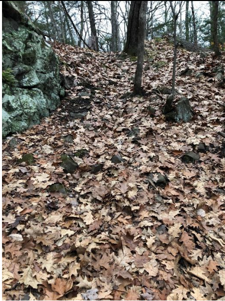
Area of concern on unofficial trail – back side of Sachem’s Head.