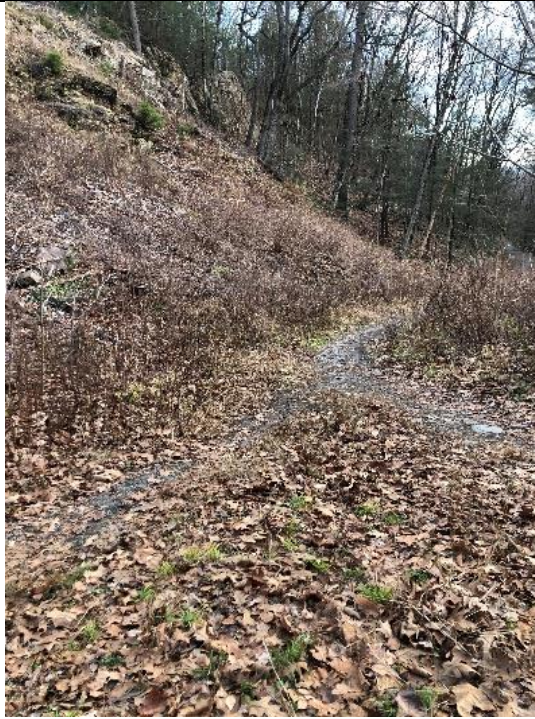
Intersection of red trail and undesignated trail. This trail goes toward Cheapside St. and connects to the Green Trail