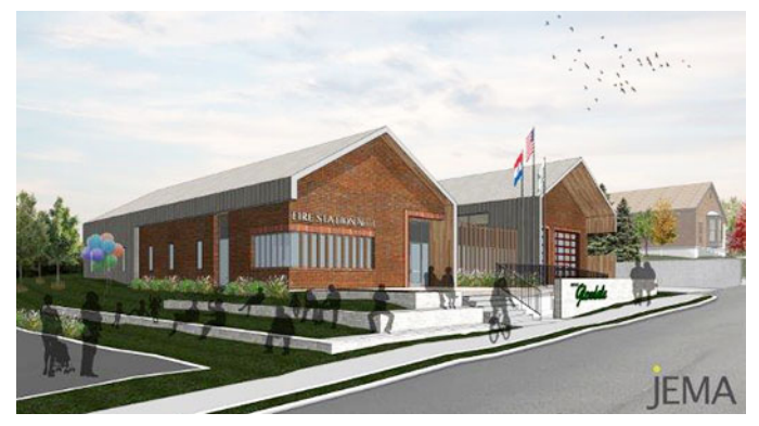
An architect's rendering of a new fire station south of the current City Hall.

Additionally, the fire station is undersized for the current firefighting force and does not