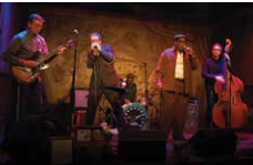
The Cash Box Kings