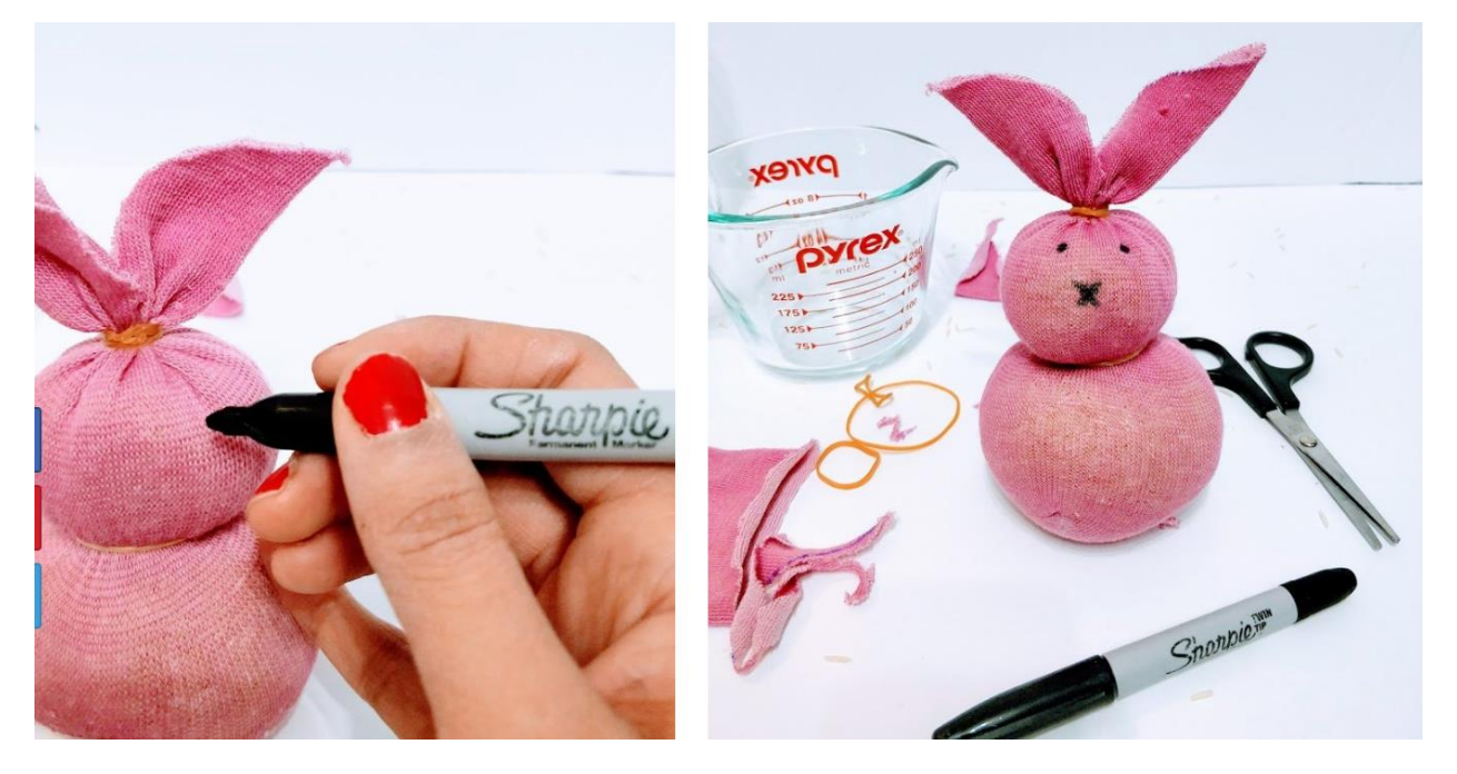
Step 8: This part is optional but it really adds a nice decorative touch to your bunny craft. Cut a long enough piece of ribbon and tie a bow around