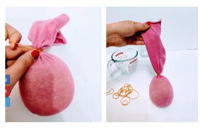
Step 3: Take the rubber band and tie the top closed

Step 2 Pour the rice into the sock. I used a measuring Pyrex cup to make it easier to pour, but you can use anything.