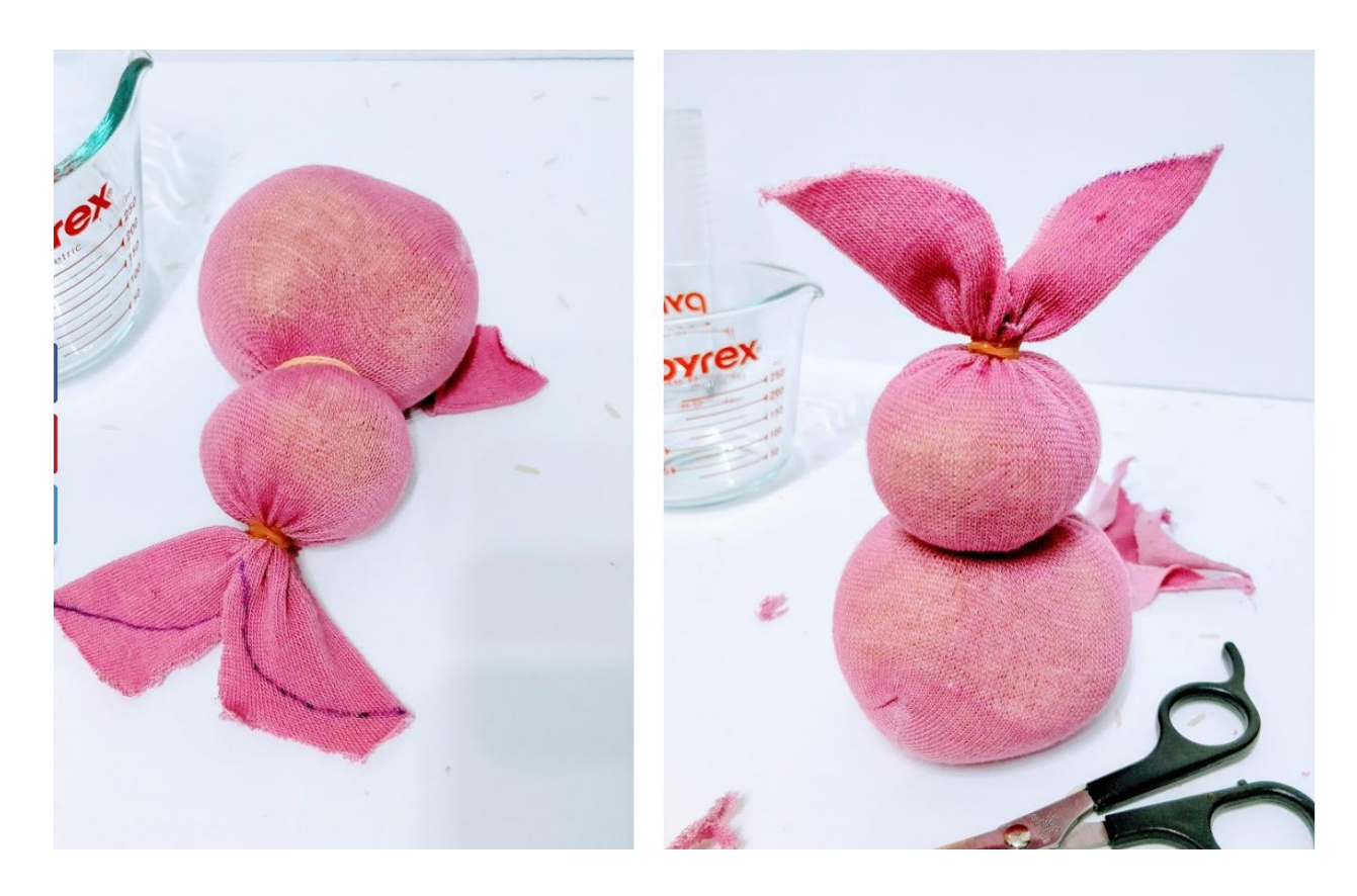
Step 7: Use the Sharpie to draw the bunny eyes and nose. To make the eyes, simply color in two dots with the marker. To make the nose, draw an "x" shape. Super Easy!

Using a marker, draw on a bunny ear shape. Take your scissors and cut along the marker line. Once done, your bunny ears should stand up straight (or flop down if you want floppy ears)