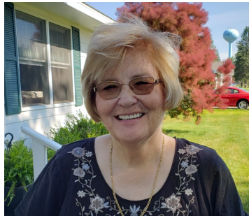
Mayor Pro Tem Sandra Szeliga