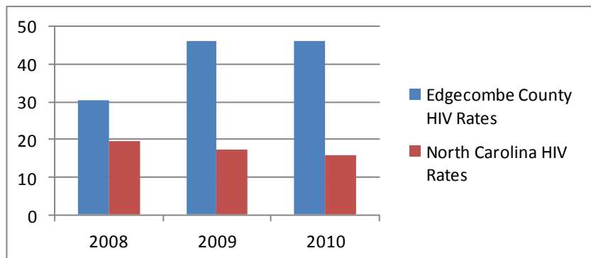
NC State Center for Health Statistics