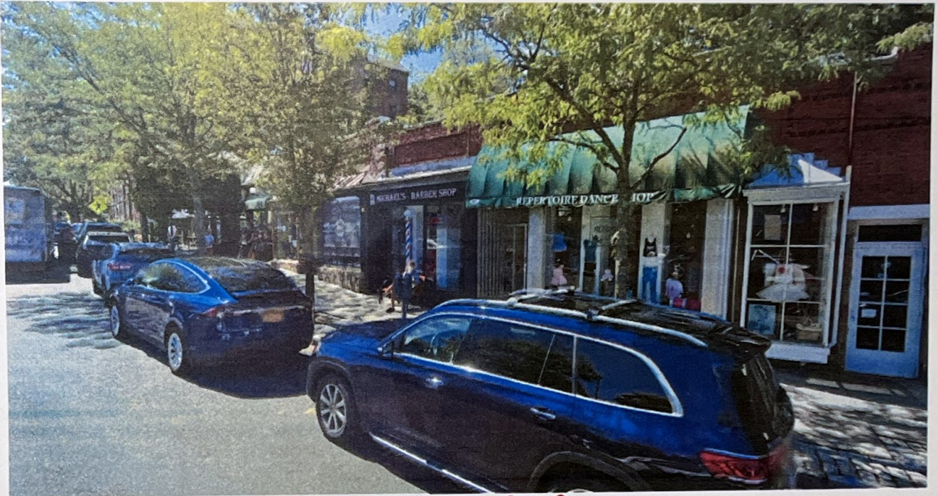
BLDG. OPPOSITE SIDE OF THE ROAD