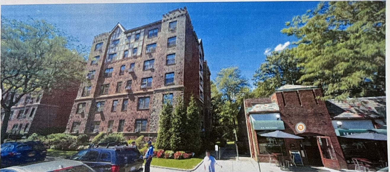
BLDG. OPPOSITE SIDE OF THE ROAD