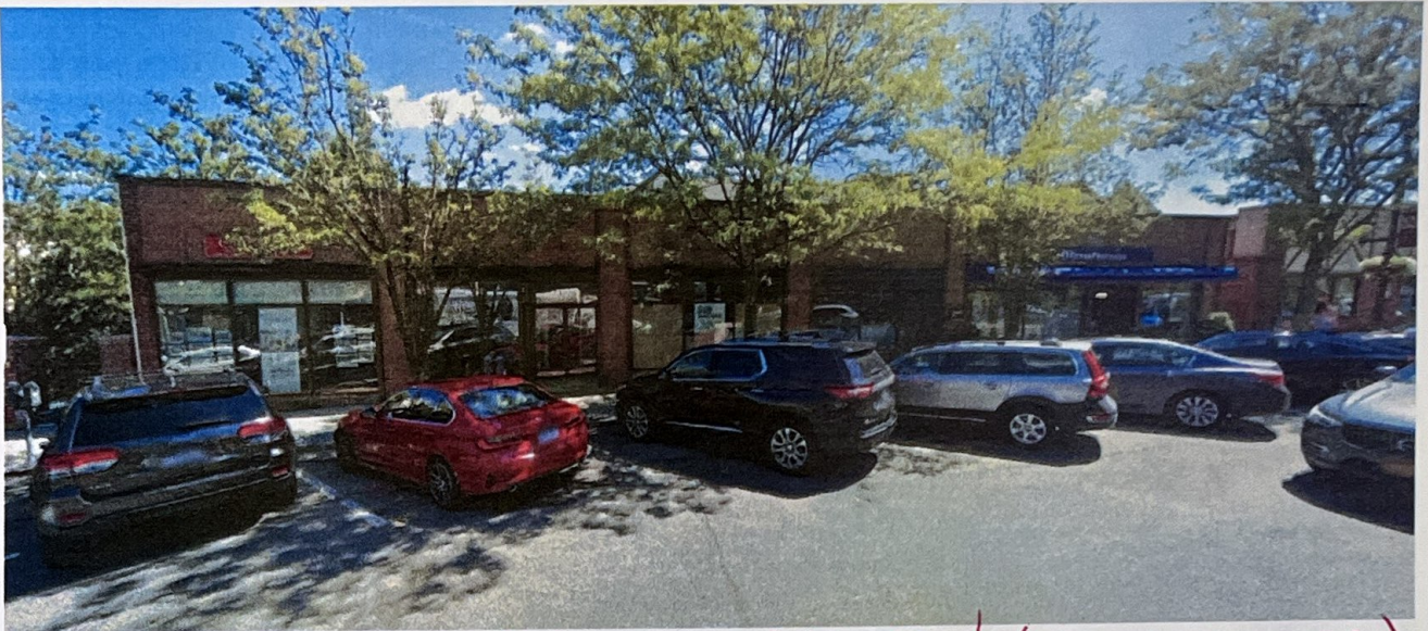
EXIST. BLDG. OF PROJECT LOCATION (78 GARTH RD.)