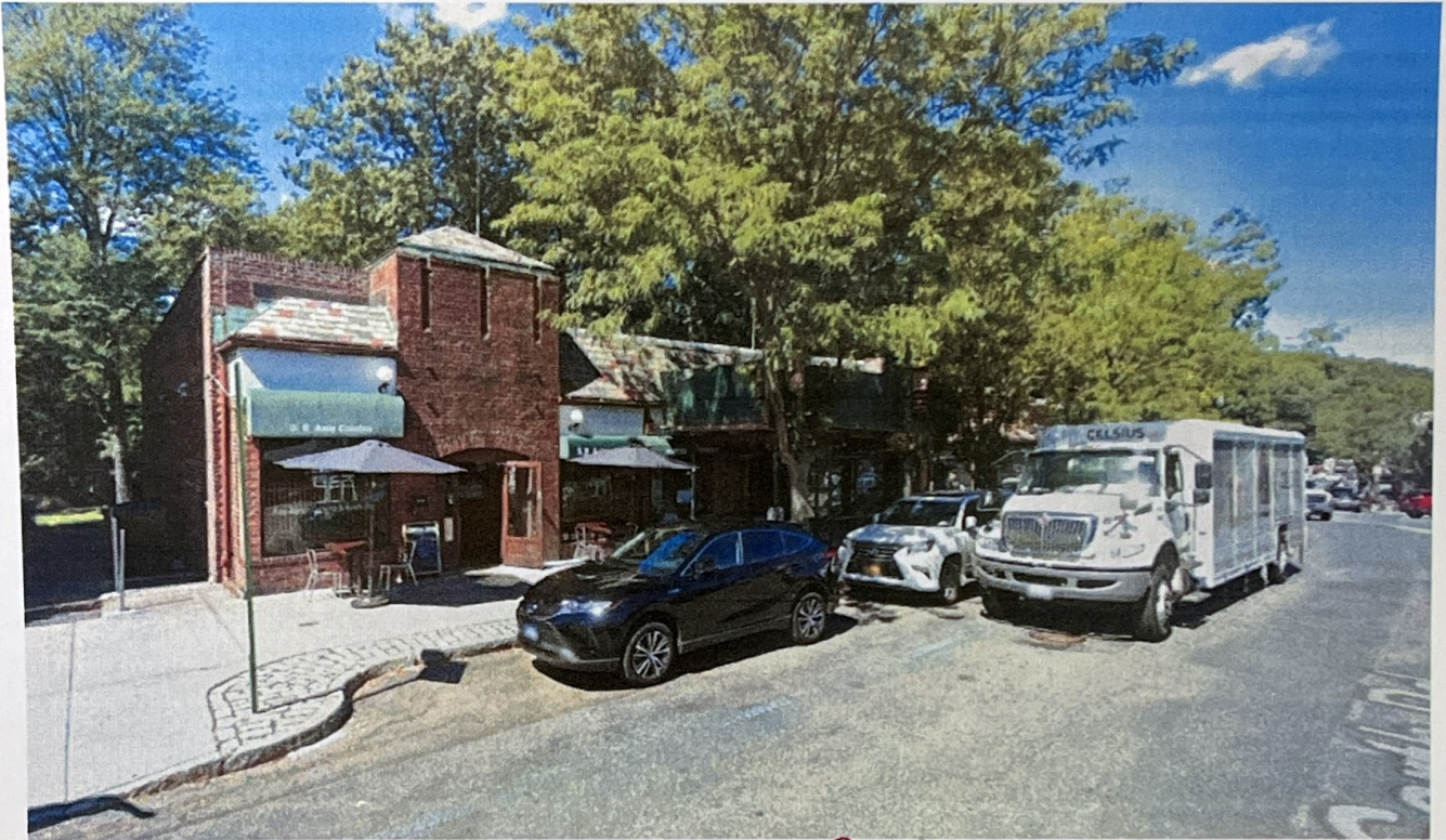
BLDG. OPPOSITE SIDE OF THE ROAD