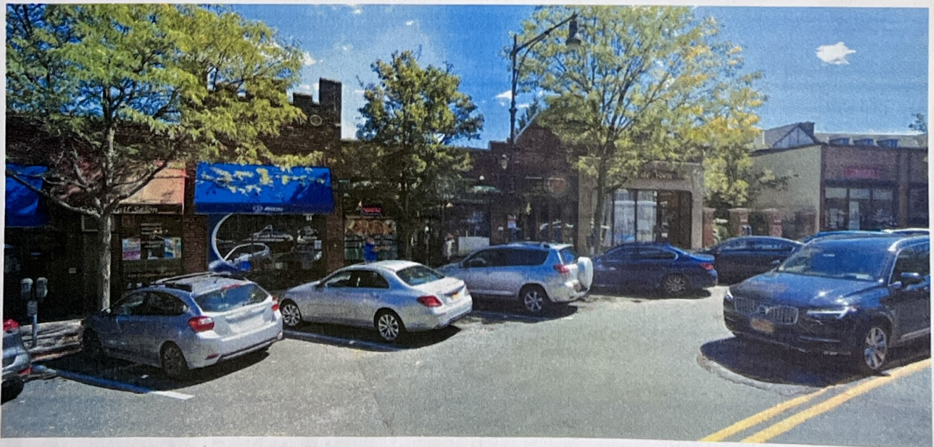
BLDG. TO THE LEFT