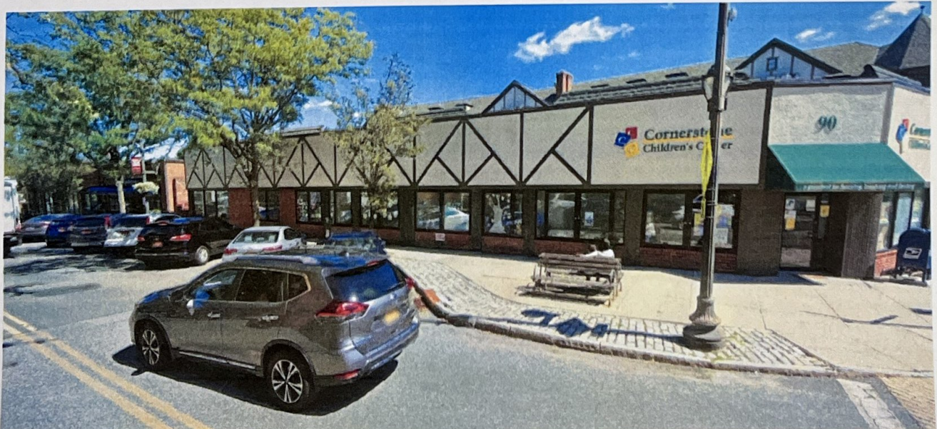
BLDG. TO THE RIGHT