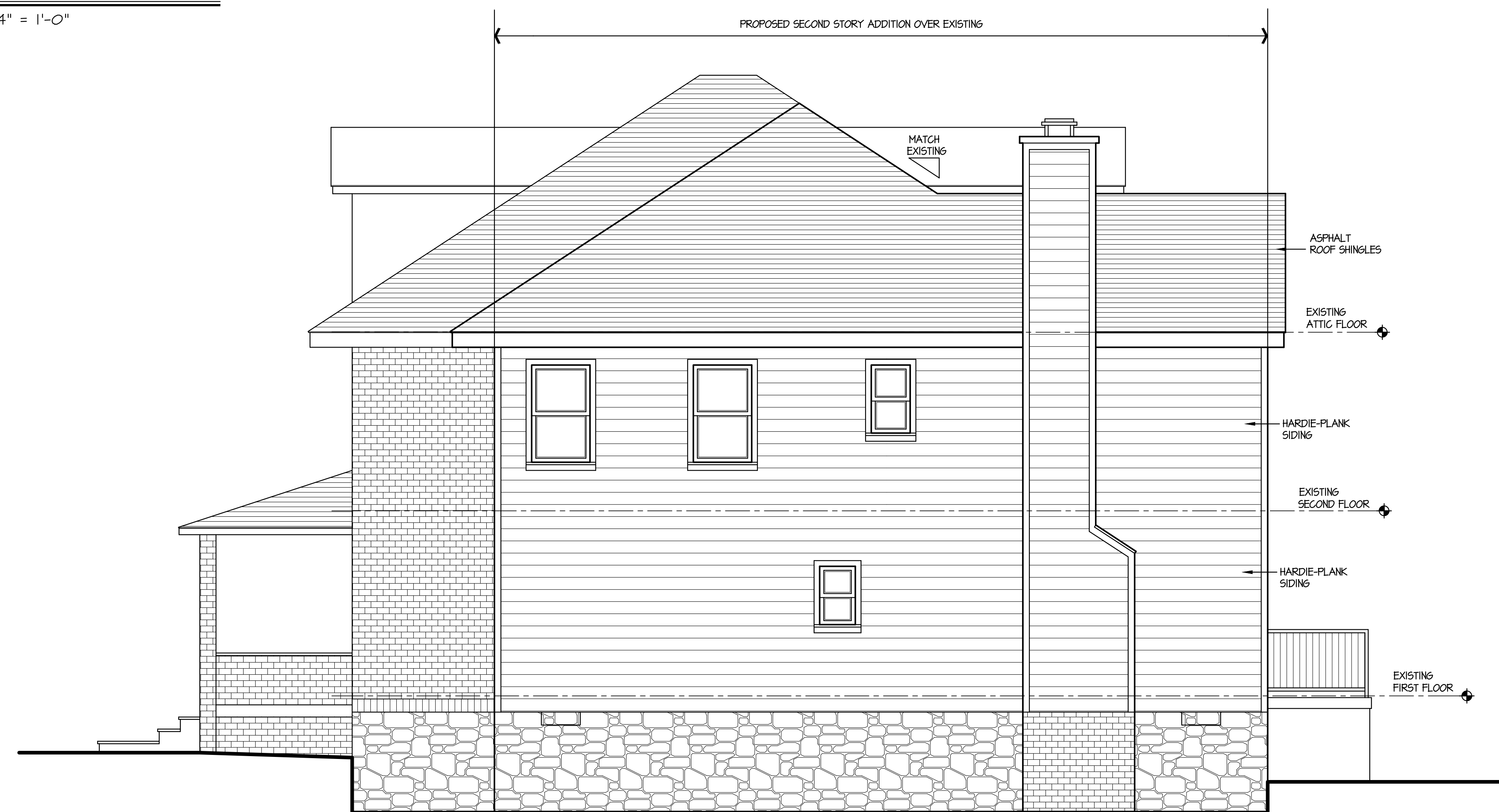
② RIGHT SIDE ELEVATION 1/4" = 1'-0"