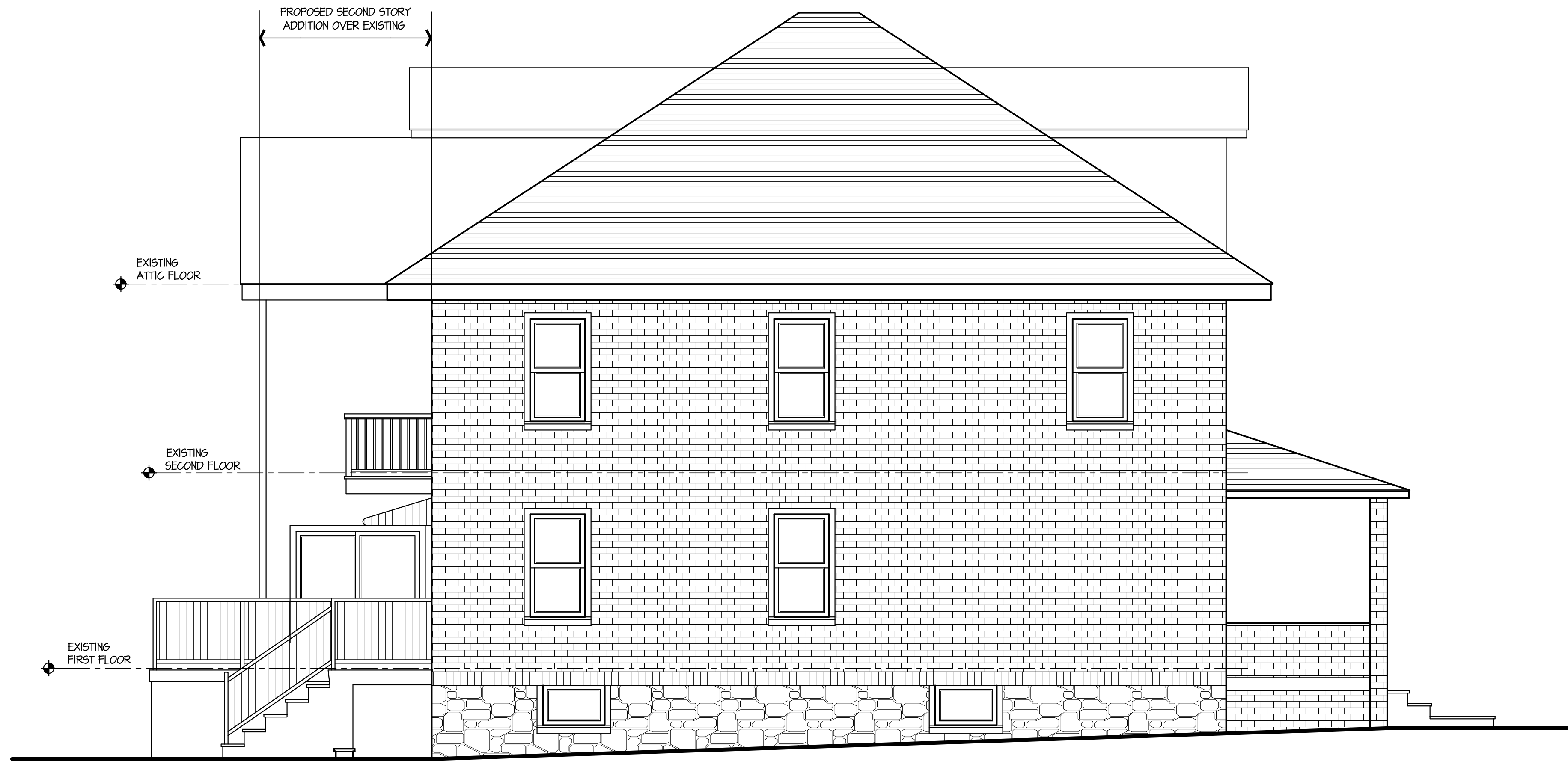
2 LEFT SIDE ELEVATION 1/4" = 1'-0"