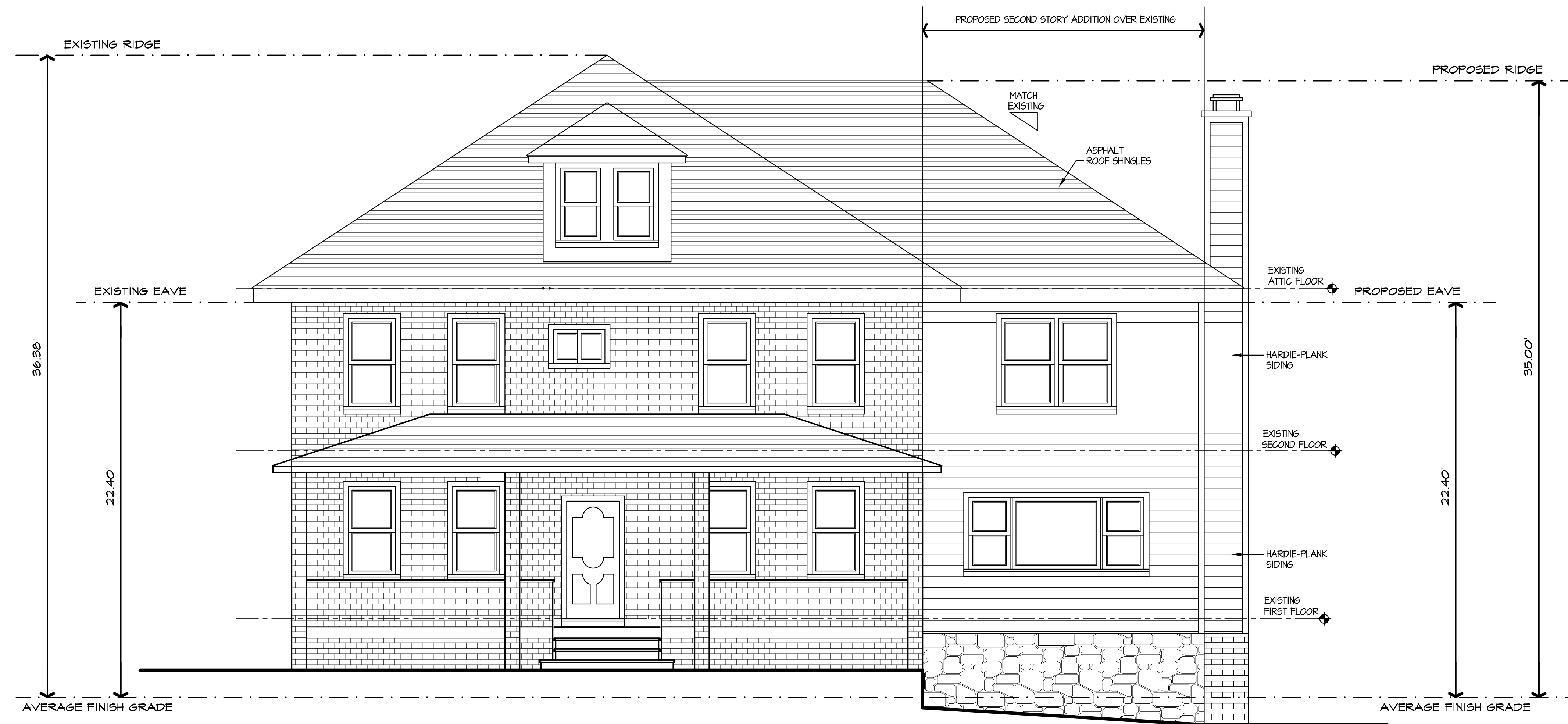
① FRONT ELEVATION 1/4" = 1'-0"