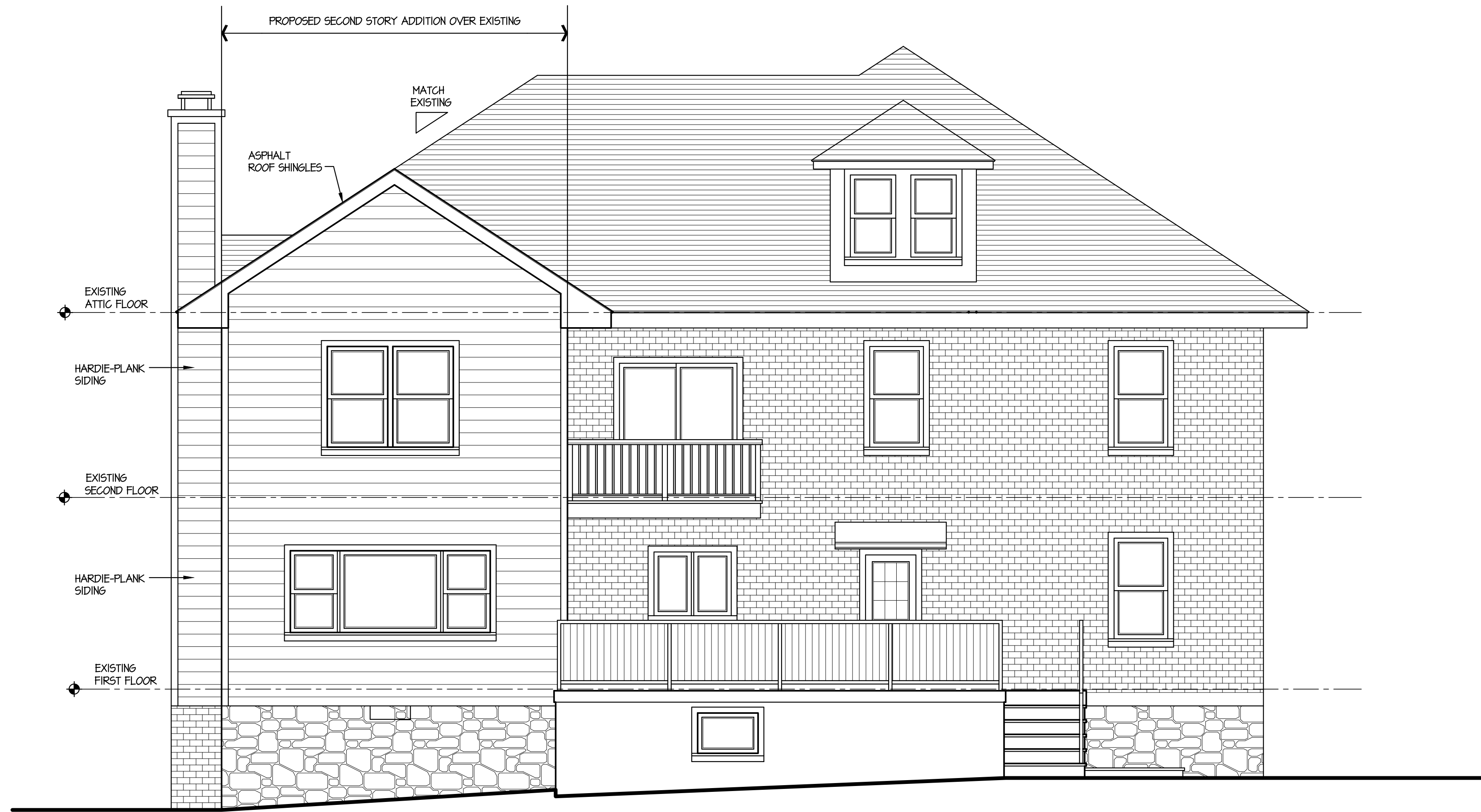
1 REAR ELEVATION 1/4" = 1'-0"