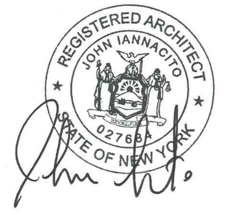
JOHN IANNACITO NYS LIC. NO. 027684

IT IS A VIOLATION OF THE NEW YORK STATE EDUCATION LAW FOR ANY PERSON, UNLESS ACTING UNDER THE DIRECTION OF A LICENSED ARCHITECT, TO ALTER AN ITEM ON THIS DRAWING IN ANY WAY. IF AN ITEM IS ALTERED, THE ALTERING ARCHITECT SHALL AFFIX TO THE ITEM HIS SEAL AND THE NOTATION "ALTERED BY" FOLLOWED BY HIS SIGNATURE AND THE DATE OF SUCH ALTERATION, AND A SPECIFIC DESCRIPTION OF THE ALTERATION.