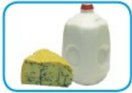
▶ Milk and dairy products