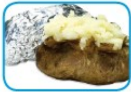
▶ Baked potatoes