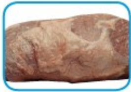
▶ Meat: beef, pork and lamb