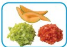
▶ Sliced melons ▶ Cut tomatoes ▶ Cut leafy greens