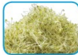
▶ Sprouts and sprout seeds