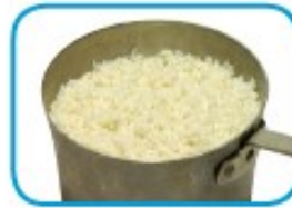
▶ Heat-treated plant food, such as cooked rice, beans and vegetables