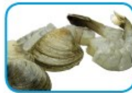
▶ Shellfish and crustaceans