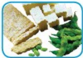
▶ Tofu or other soy protein ▶ Synthetic ingredients, such as textured soy protein in meat alternatives