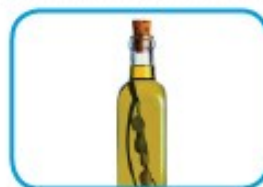
▶ Untreated garlic-and-oil mixtures