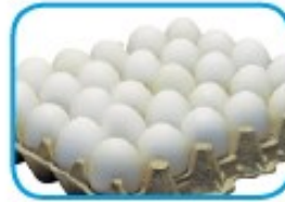
▶ Shell eggs (except those treated to eliminate Salmonella spp.)