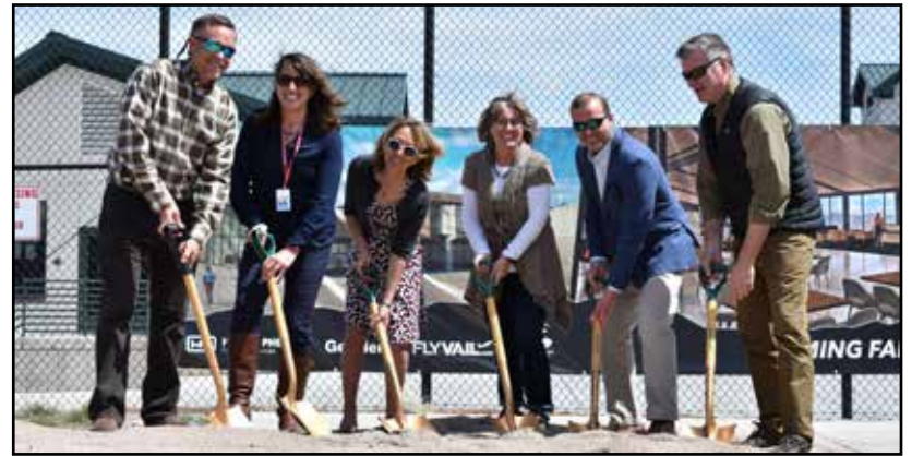
County officials celebrate the groundbreaking of the airport terminal expansion project.