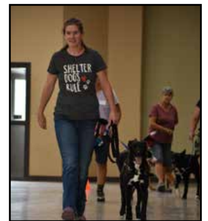
Free training is offered for all dogs adopted from the Eagle County Animal Shelter.

Increased housing stock in the county through several public-private partnerships, including 6 West Apartments, with 120 for-rent resident occupied deed restricted units; and Spring Creek Apartments, with 282 for-rent units with rents restricted at 60 to 80 percent of area median income rates.