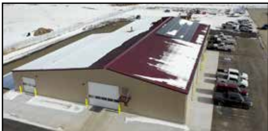
The new Facilities workshop provides expanded space for county operations, plus includes solar panels and a recycled oil heating system.

Increased field staffing, allowing a shift from reactive enforcement to a more proactive approach to animal control in 2018. As a result, contacts increased by 24 percent and patrols increased by 445 percent over the year, enhancing safety for both pets and people countywide.