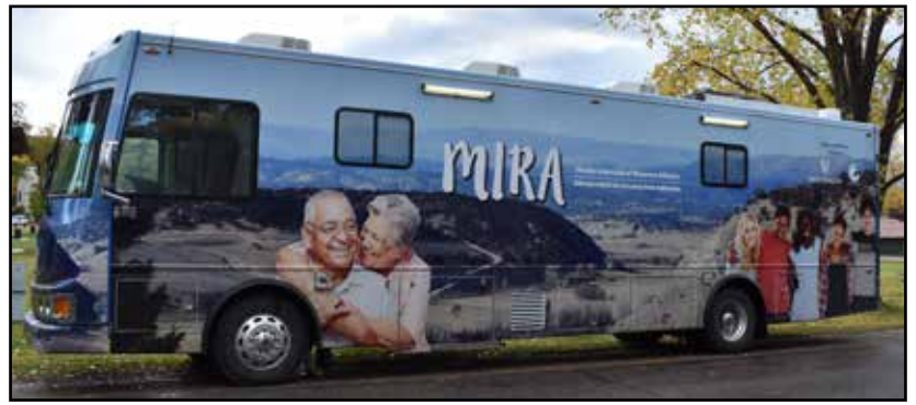
The MIRA bus brings resources and services directly to the neighborhoods that need them.

Increased pet adoptions from 253 in 2017 to 327 in 2018; and transferred in 172 animals from high-kill shelters outside of the county to assist them in finding forever homes.