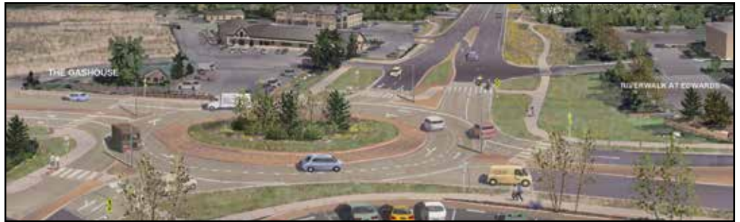
The final design for the Edwards Spur Road improvement project was completed in 2018.