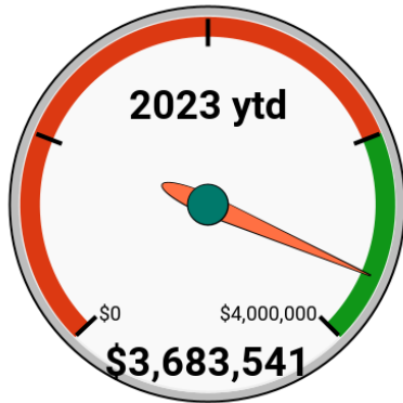
Year to Date Comparison to Budget