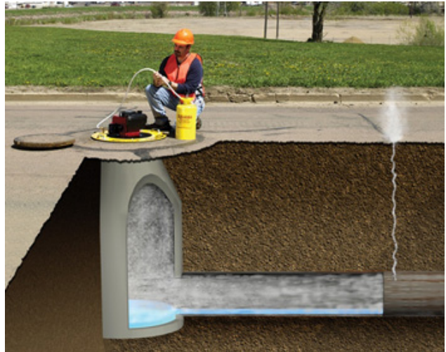
1: Smoke Testing (photo for informational purposes only)