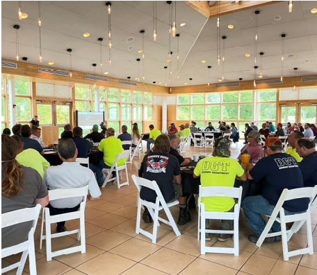
SWM brought back in-person staff trainings for all MS4 agencies in 2023, hosting two professional seminars and an FEQ class.