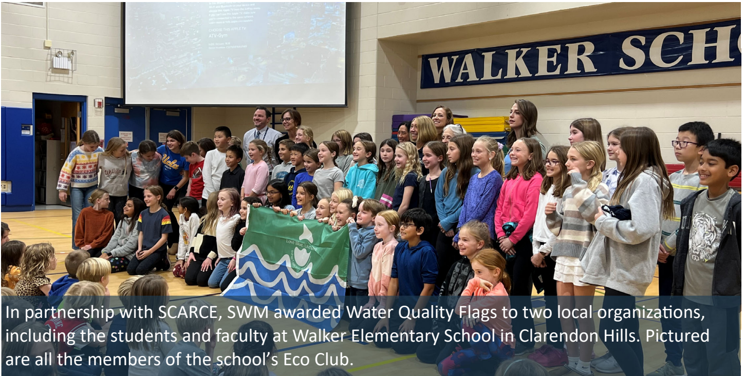
In partnership with SCARCE, SWM awarded Water Quality Flags to two local organizations, including the students and faculty at Walker Elementary School in Clarendon Hills. Pictured are all the members of the school's Eco Club.