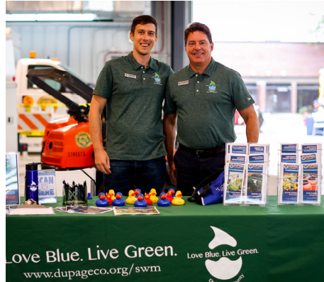
In 2023, SWM participated in several community events, including the Wood Dale Public Works Open House.