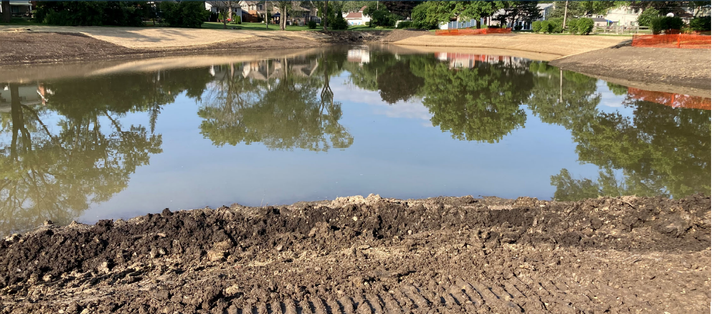
Lufkin Pond Drainage Project in Villa Park mid-progress, funded entirely through ARPA.

Using SWM's ARPA allocation, the SWM Planning Committee doled out funds to a large variety of projects with our municipal partners. 16 of the 26 municipal ARPA projects have been completed to date, and the rest will begin in 2024.