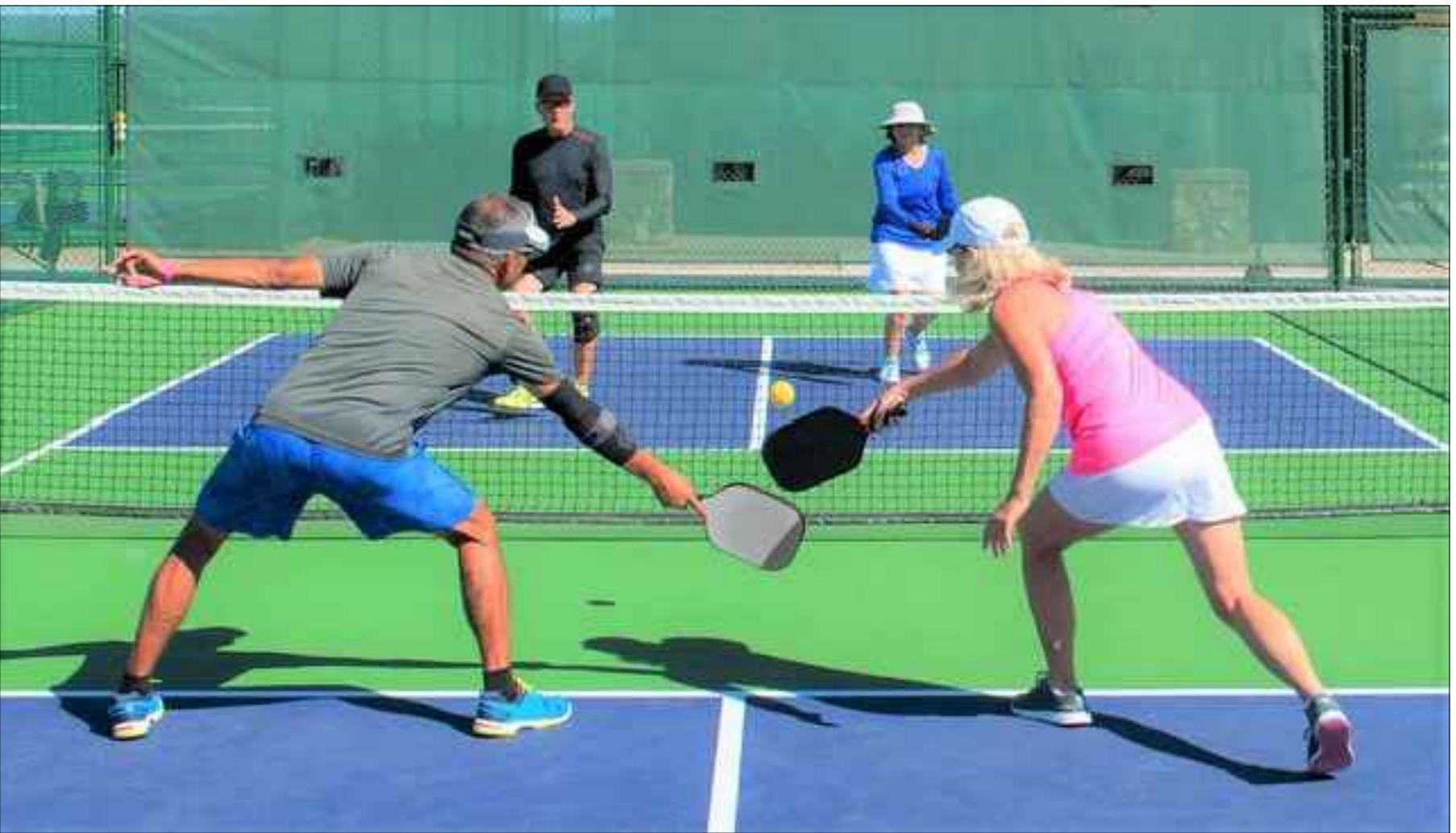
PHOTO EXAMPLE OF PICKLEBALL NOT TO SCALE