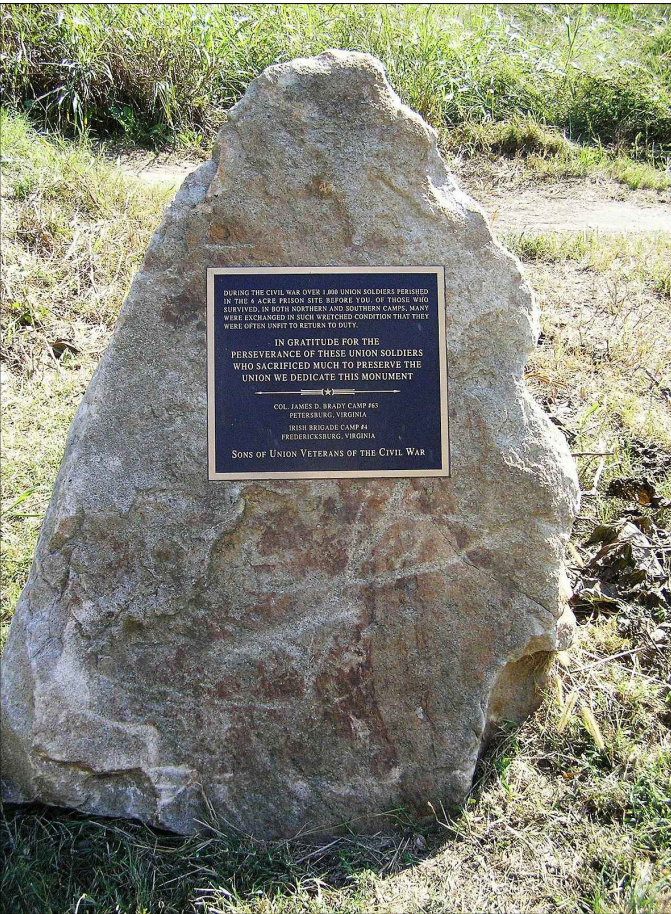
PHOTO EXAMPLE OF MONUMENT BOULDER NOT TO SCALE