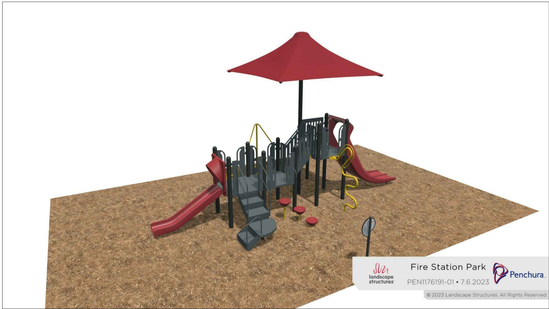
PHOTO EXAMPLE OF PLAYGROUND NOT TO SCALE