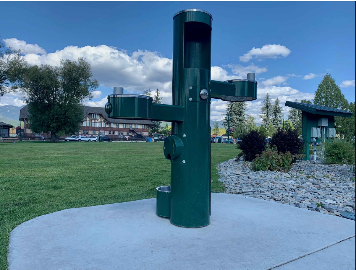
PHOTO EXAMPLE OF DRINKING FOUNTAIN NOT TO SCALE