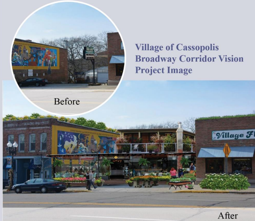
Village of Cassopolis Broadway Corridor Vision Project Image

MSU Extension (MSUE) and the School of Planning, Design and Construction (SPDC) have jointly developed SBEI to address sustainability challenges and improve the quality of life in Michigan’s communities. The partnership allows for an integrated approach to solving complex community problems through the diverse expertise found within SPDC, including Construction Management, Interior Design, Landscape Architecture and Urban & Regional Planning, along with MSUE’s institutes and Extension educators.