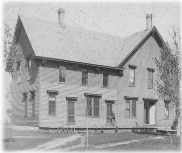
1883 – Third Cottonwood County Courthouse