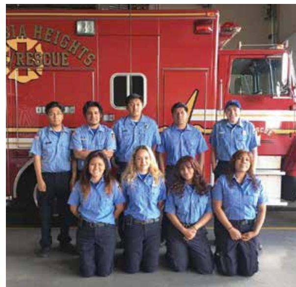
Columbia Heights Fire Explorers then and now.