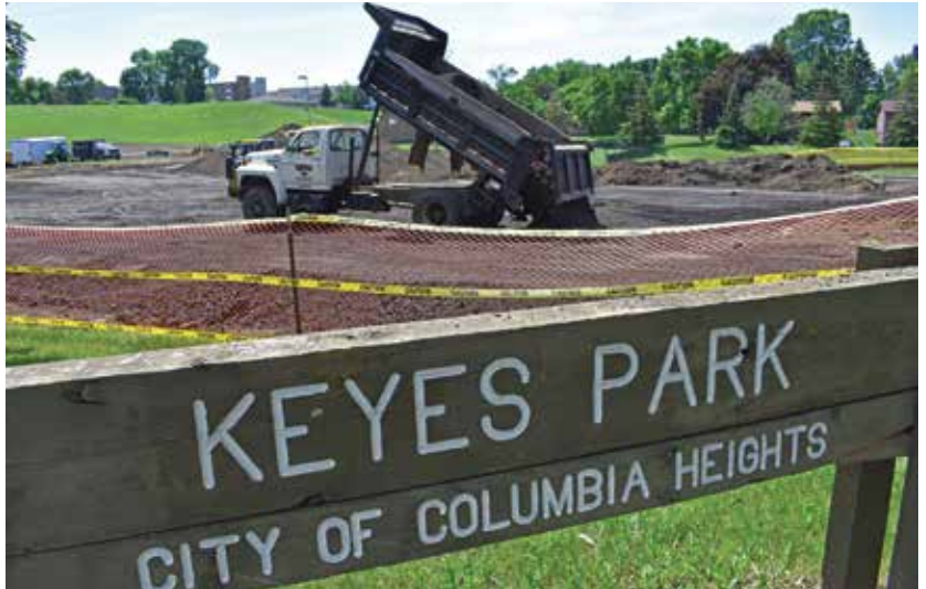
This summer, it was Keyes Park's turn to receive upgrades.

Keyes Park was the seventh park selected by the Park and Recreation Commission to be renovated under the City's master planning process. The City has already implemented park master plan renovations for six parks—LaBelle, Huset Park West (partial renovation), Prestemon, Ramsdell, Silver Lake and Sullivan Lake.