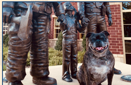
Submitted by Erica Tollefson