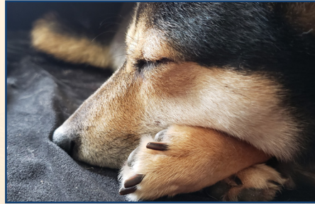
Submitted by Tracy Steinkopf