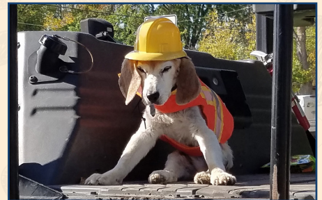
Submitted by Becky Groseth