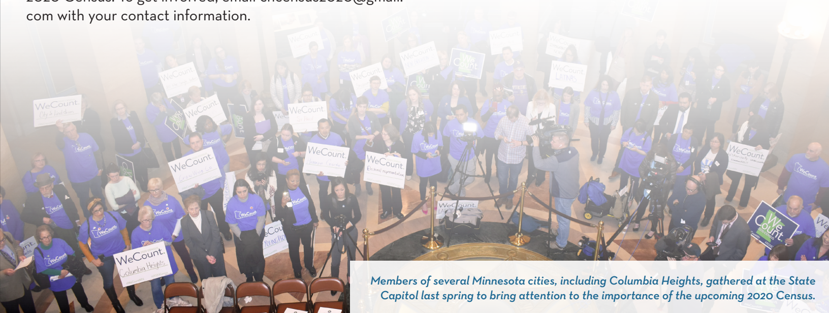
Members of several Minnesota cities, including Columbia Heights, gathered at the State Capitol last spring to bring attention to the importance of the upcoming 2020 Census.

Visit mn.gov/admin/2020-census to learn more or to find out about Census job openings.