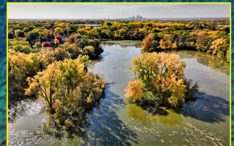
Submitted by Phillip Zuidema