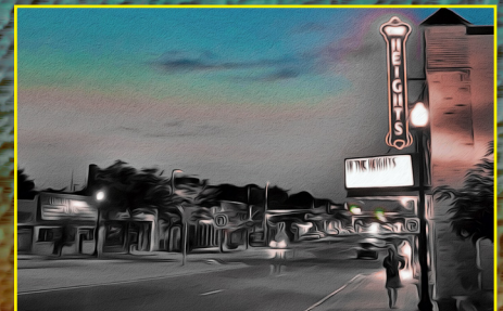
Submitted by Ben Sandell