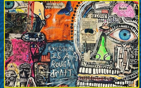
Submitted by Levi Berg