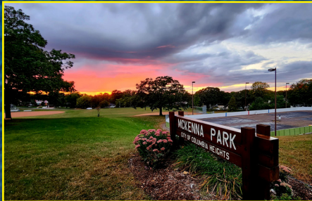
Submitted by Todd Kewatt