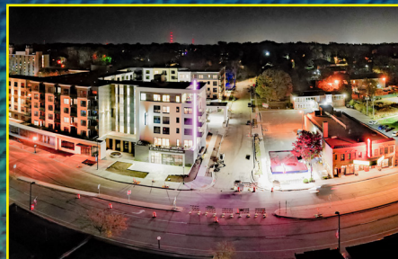
Submitted by Phillip Zuidema