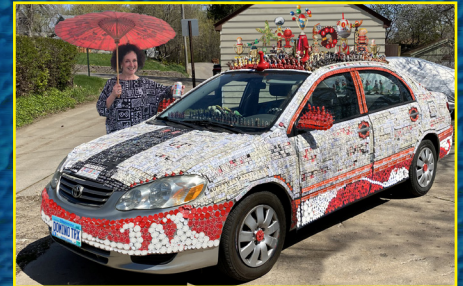
Submitted by Tjody deVaal