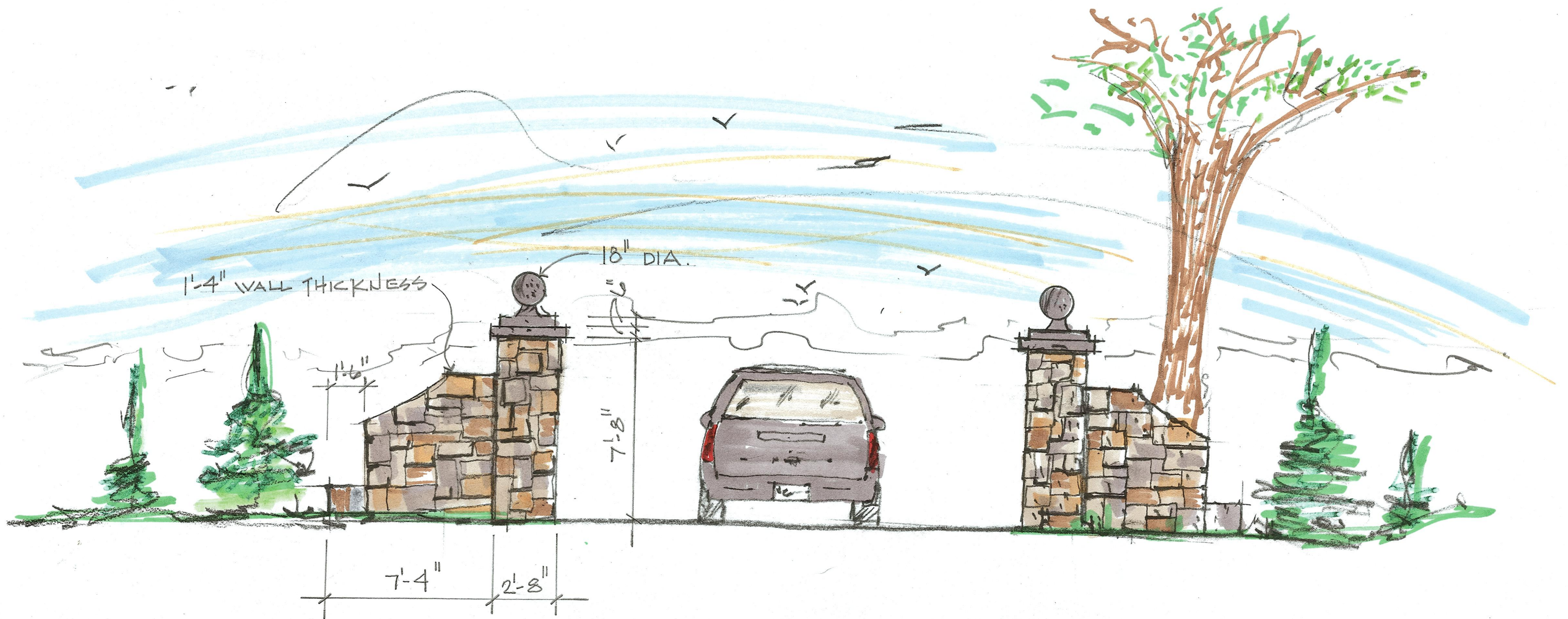
ENTRANCE GATE, LOOKING SOUTHEAST