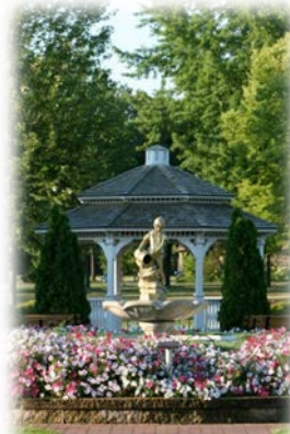
Smith Park Gardens