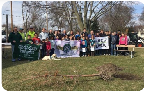
Tree City USA