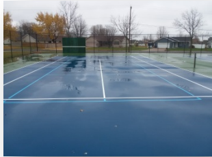
Barker Farm Park