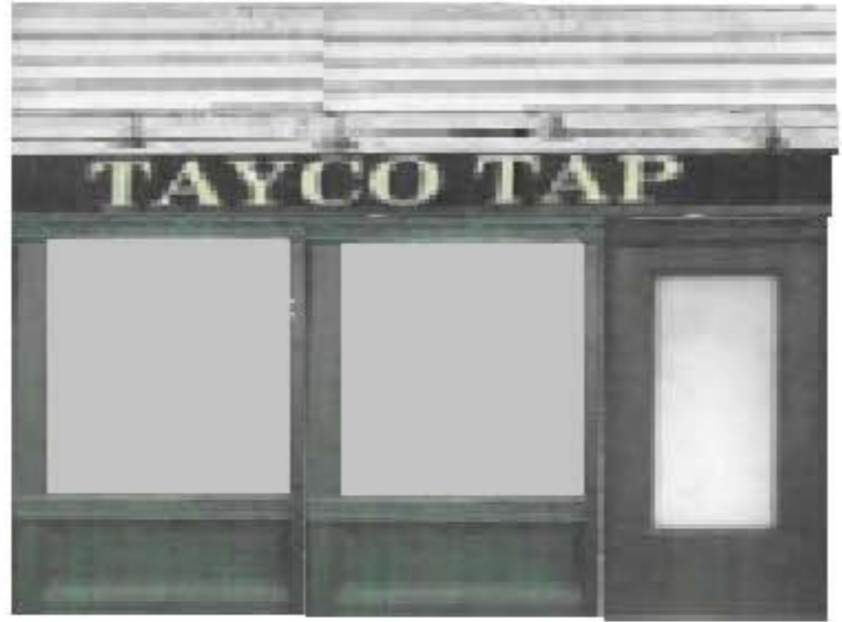
Side wall Panels