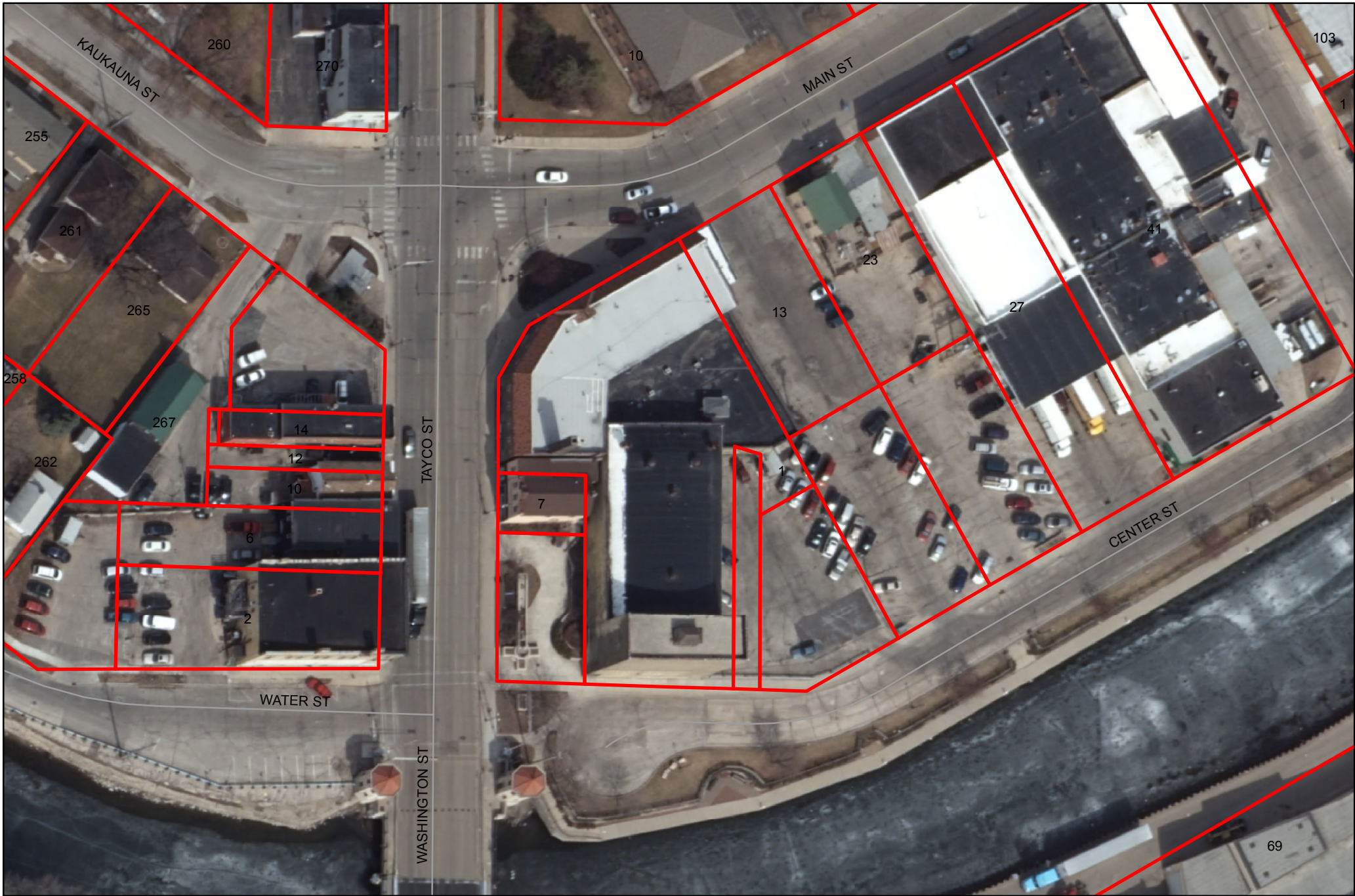
Menasha Parcels 1 Main Street