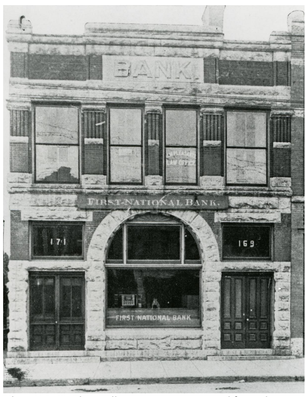
The stones in this walkway were repurposed from the First National Bank of Menasha, Built in 1887. It stood across the street at 175 Main Street.