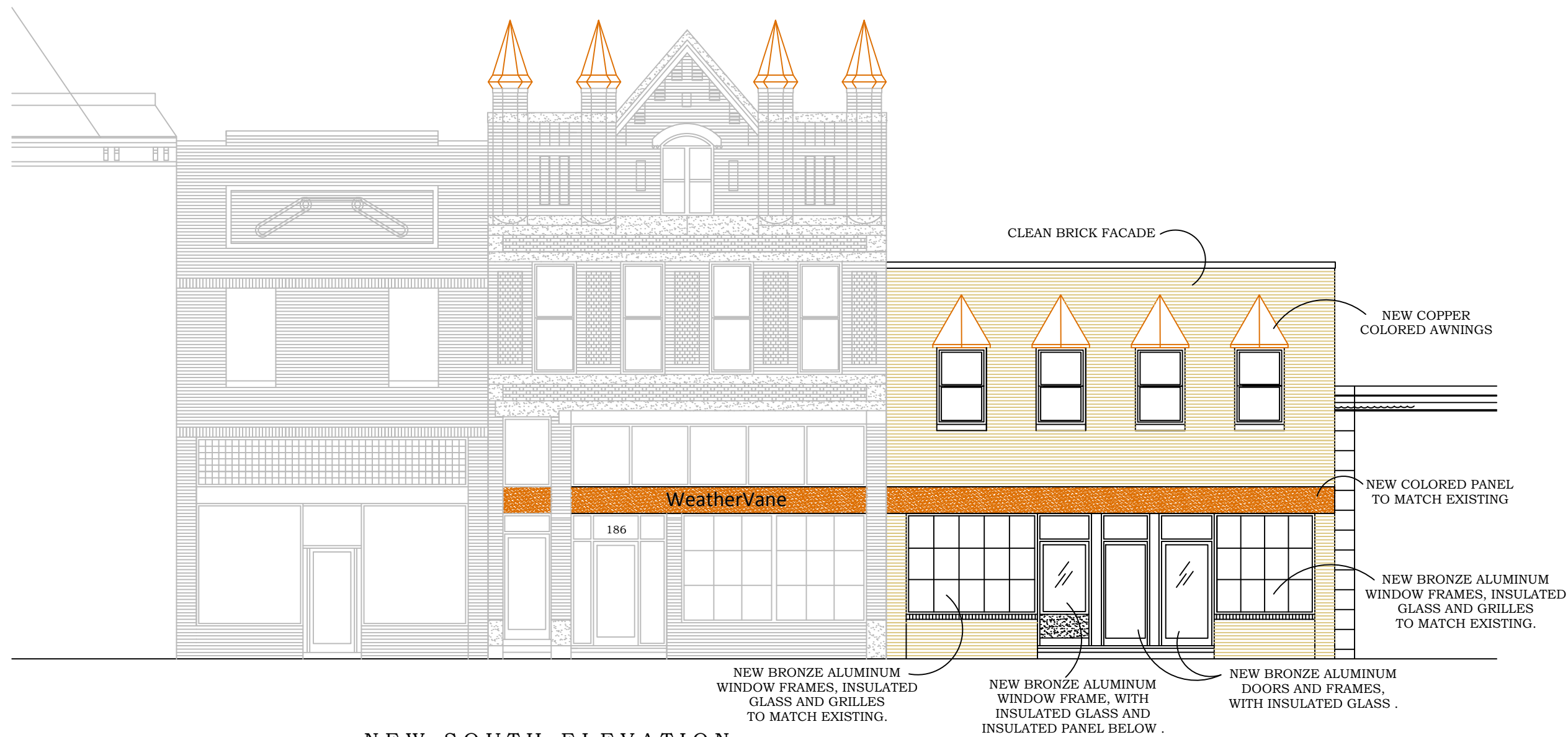
NEW SOUTH ELEVATION 0 5 10 25 50