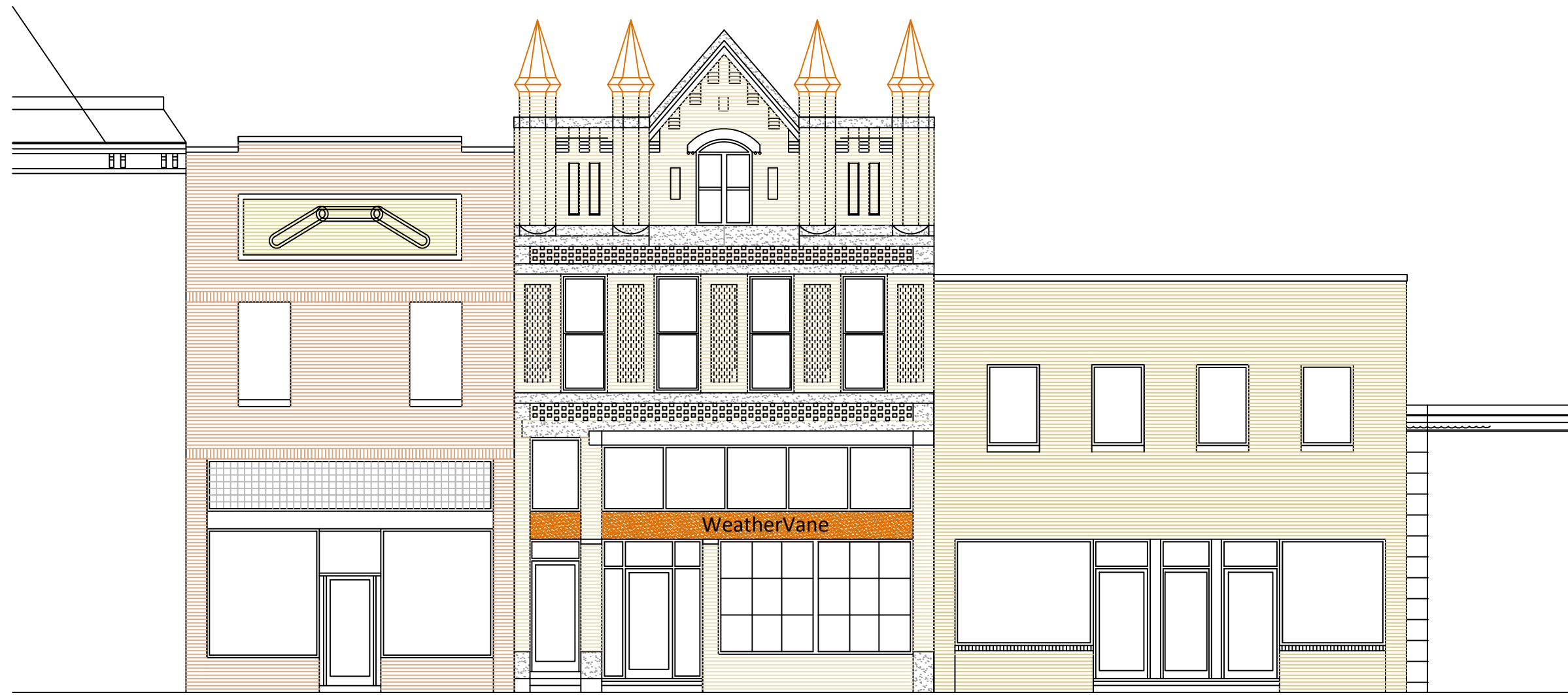
EXISTING SOUTH ELEVATION 0 5 10 25 50