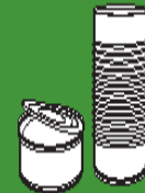
Tin or Steel Cans [Latas de hierro u hojalata]

Do not include food waste, films, plastic bags, plastic wrap, or foam cups and containers.