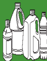
Plastic Bottles and Containers #1-7 [Botellas de plástico y recipientes #1-7]