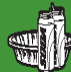
Aluminum Cans, Aluminum Foil and Pie Tins [Latas de aluminio, papel aluminio y moldes para pay]