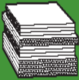
Flattened Cardboard [Cartón aplanado]